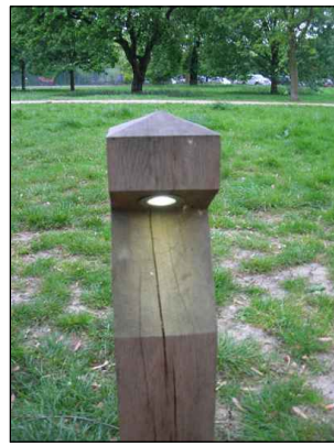
DOWNWARD FACING LIGHTS ON TIMED PIR SENSORS TO PATHWAY

NOTE: AS PER THE RECOMMENDATIONS OF THE ECOLOGY SURVEY. LIGHTING WILL BE LOW IMPACT. ALL LIGHTS ARE ON TIMED PIR SENSORS. MINIMAL LIGHTING TO DECKS, WALKWAYS AND STAIRS. ADDITIONAL 6 NO DOWNWARD FACING LIGHTS ON TIMED PIR SENSORS TO PATHWAY FURTHER DETAILS FOR LIGHTING TYPE ETC ARE INCLUDED IN THE CONSTRUCTION METHOD STATEMENT