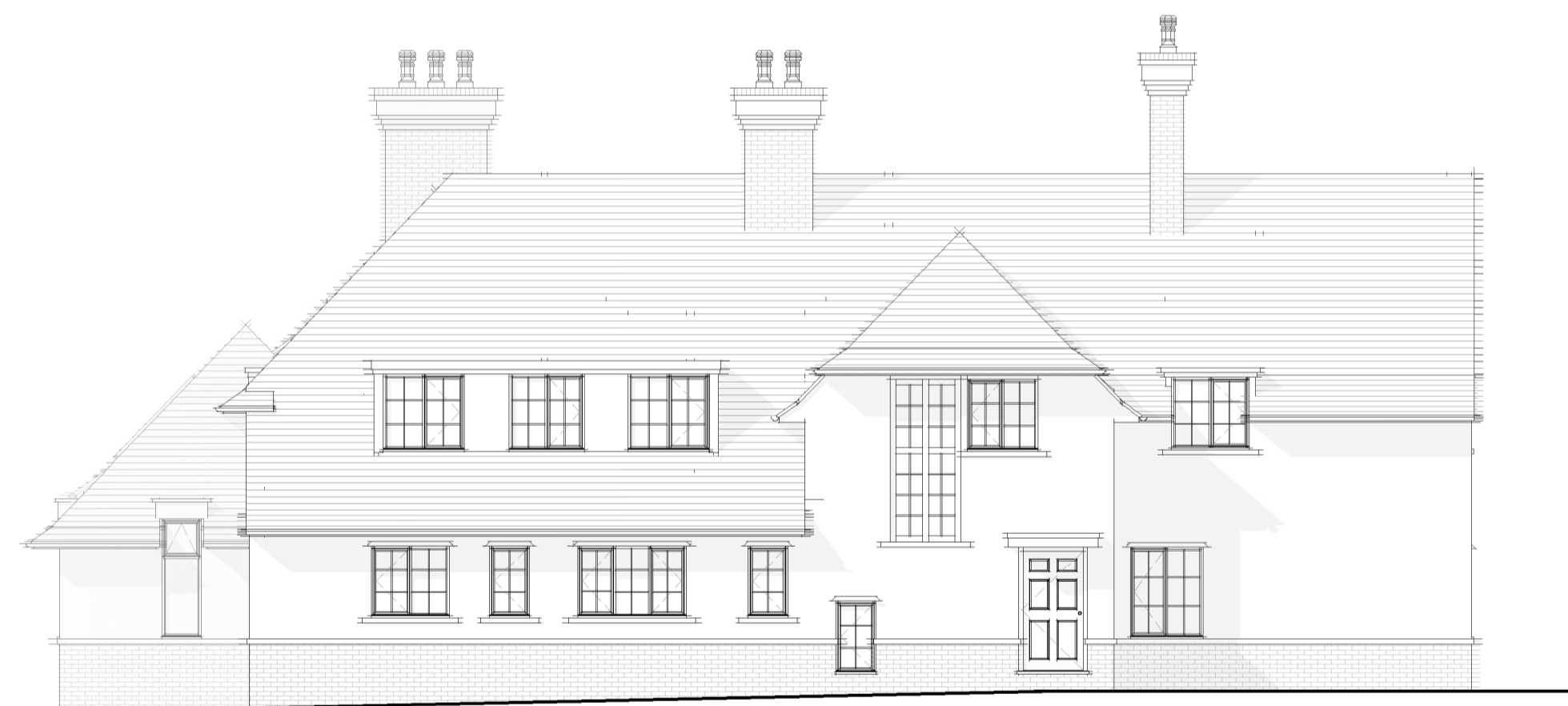
Existing North-East Elevation (Front) 1:100