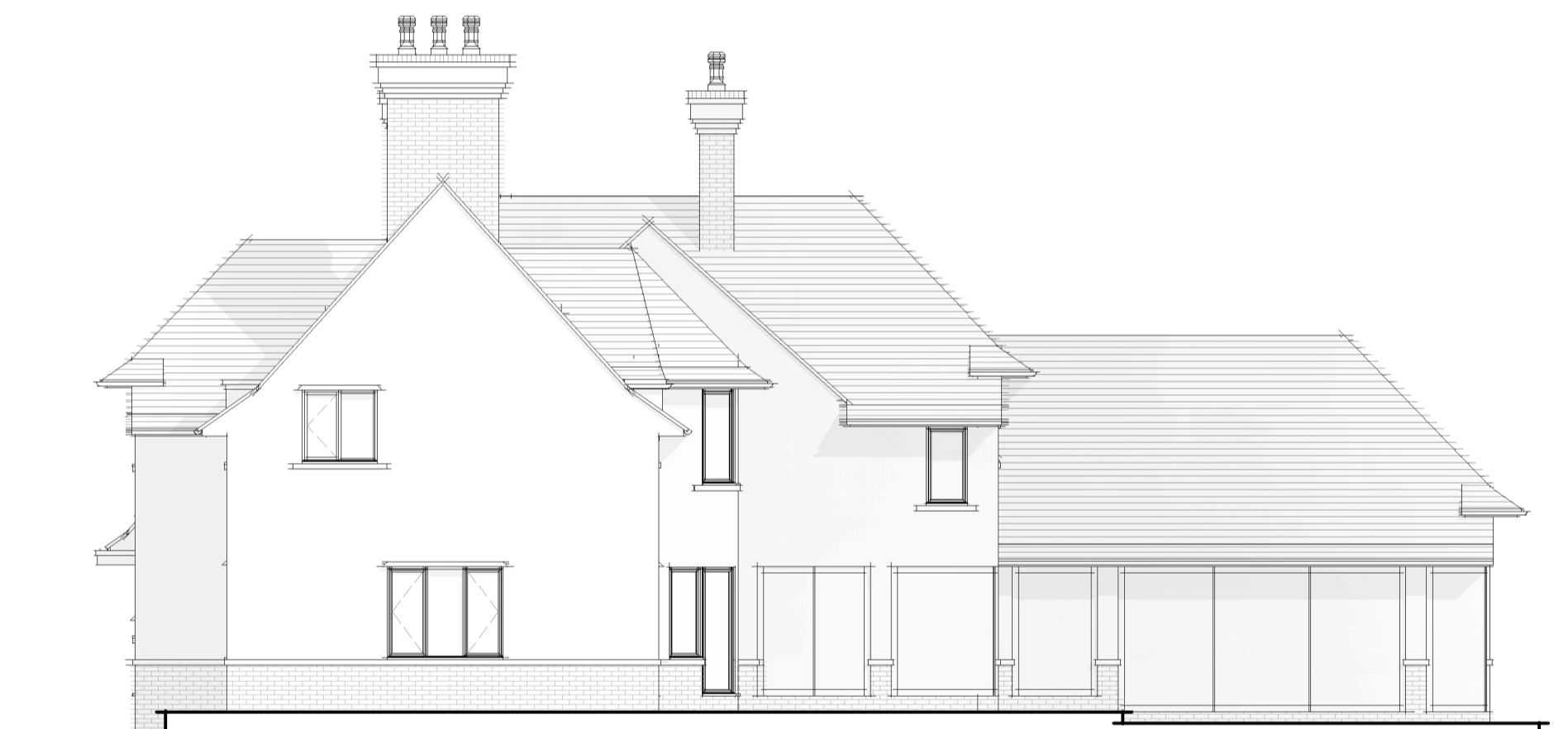
Existing North-West Elevation (Side) 1:100