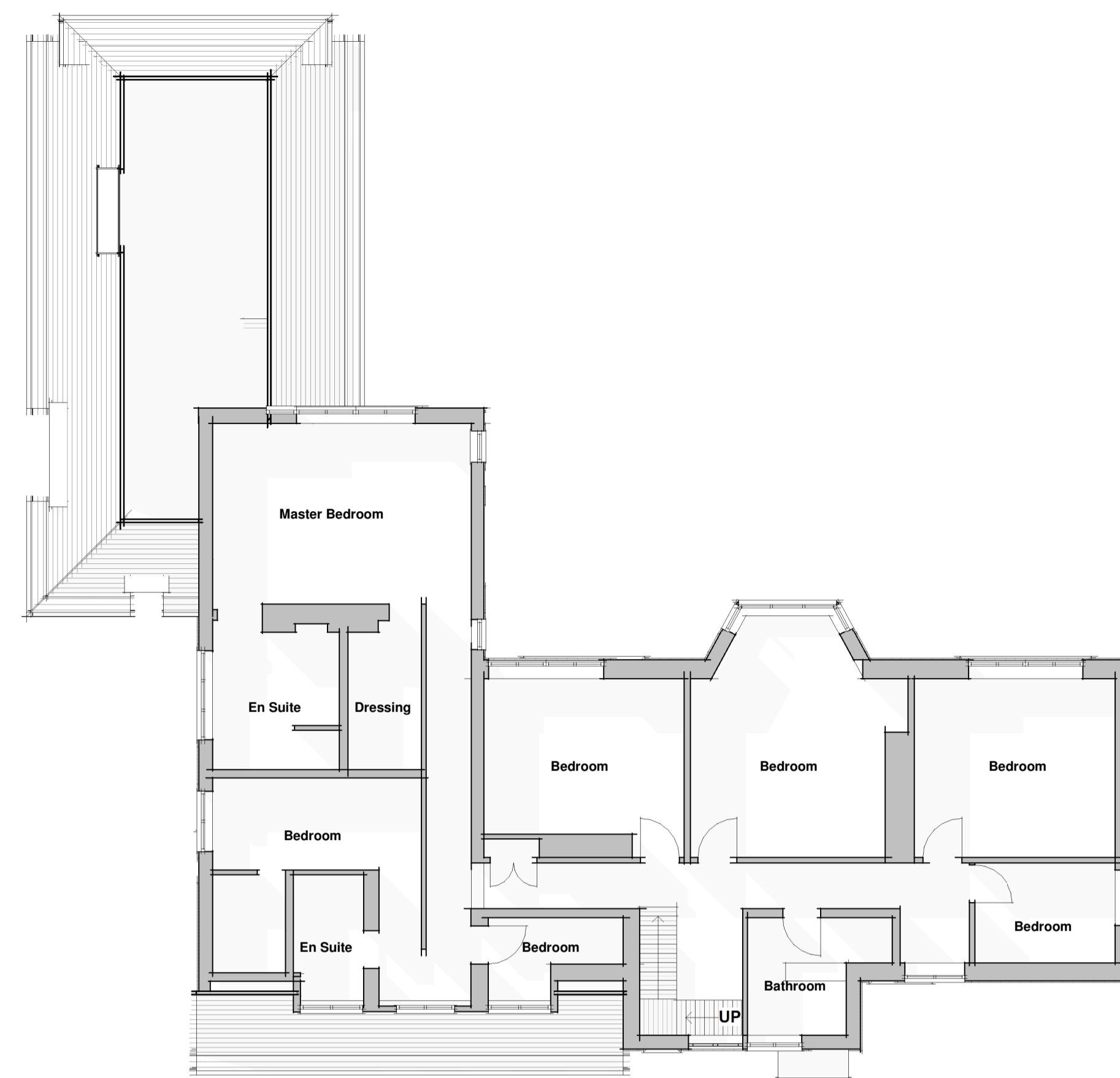
Existing First Floor 1:100