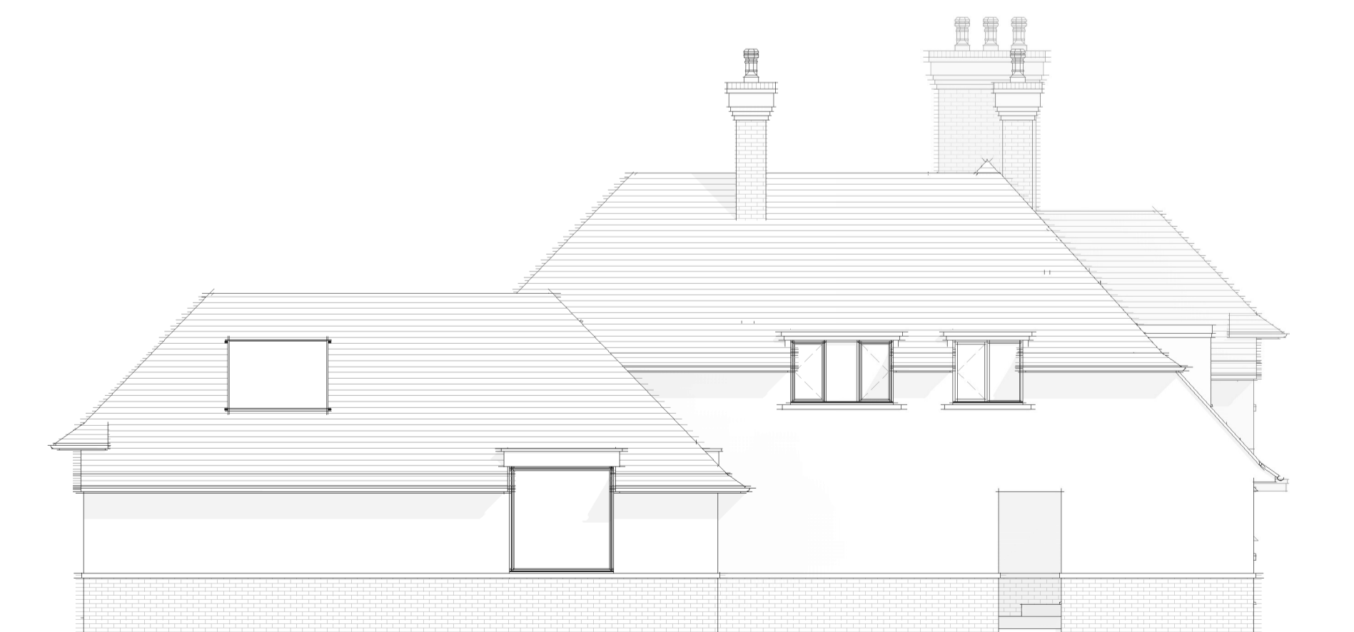
Existing South-East Elevation (Side) 1:100