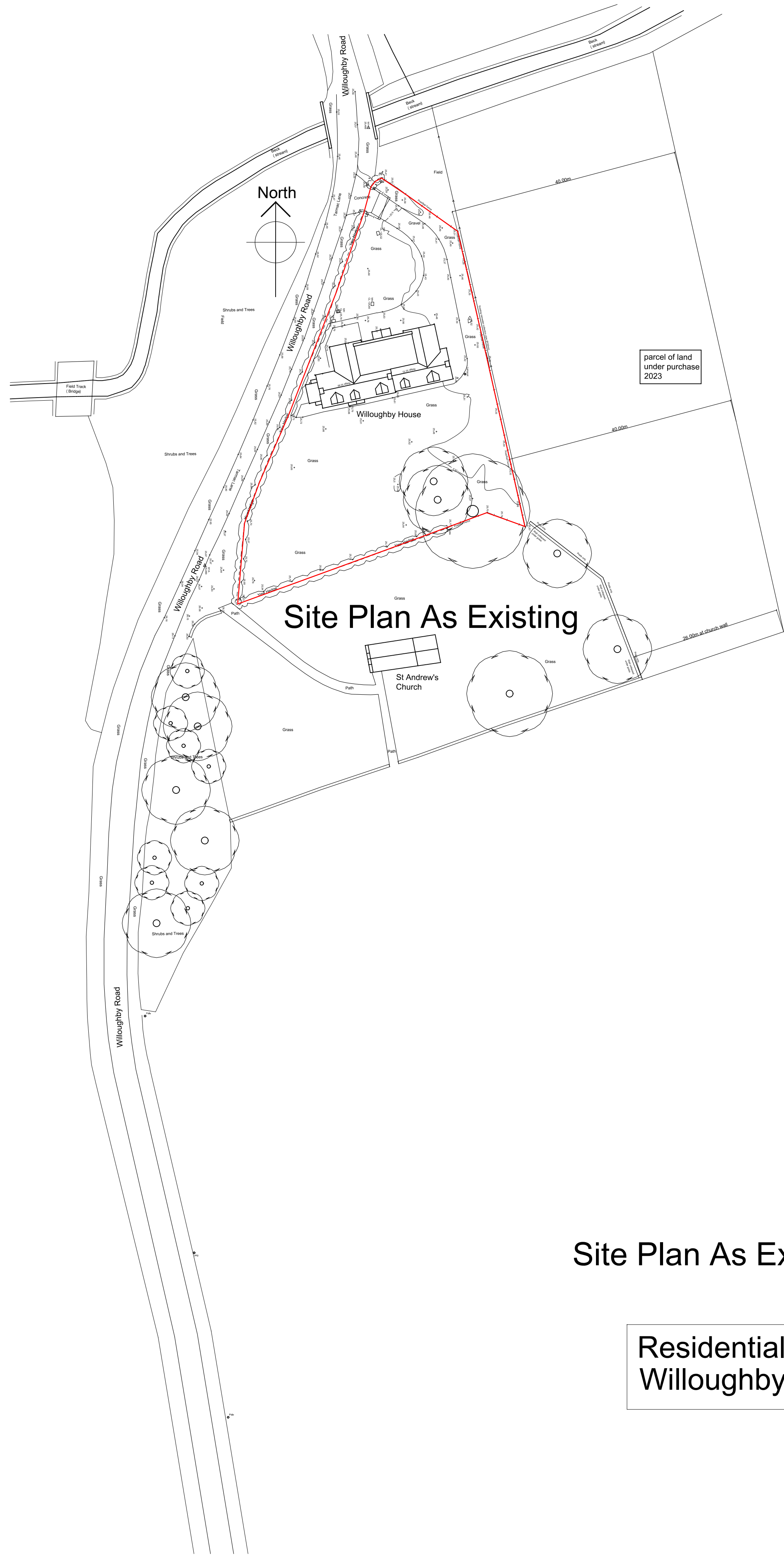
Site Plan As Existing