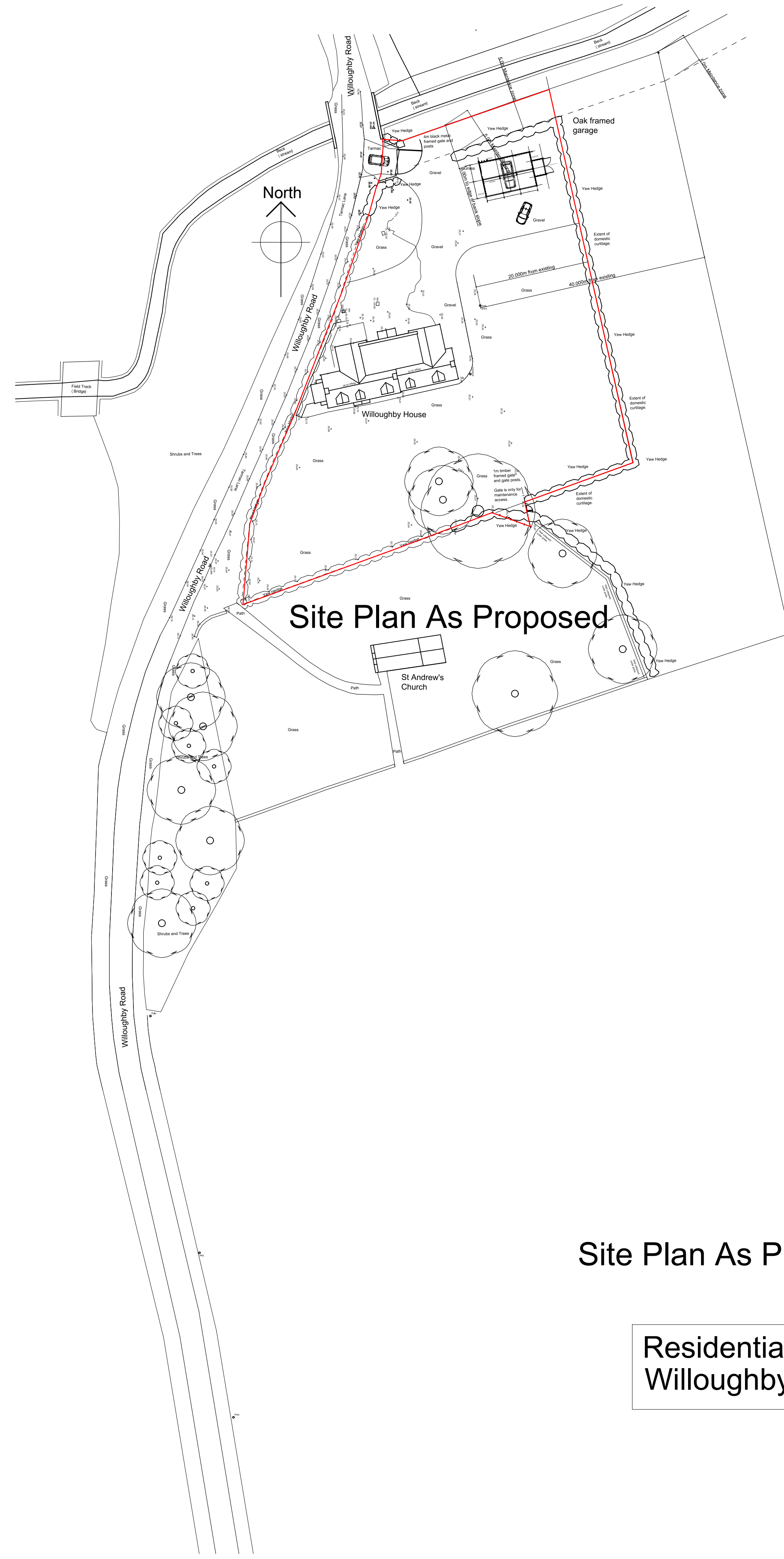
Site Plan As Proposed