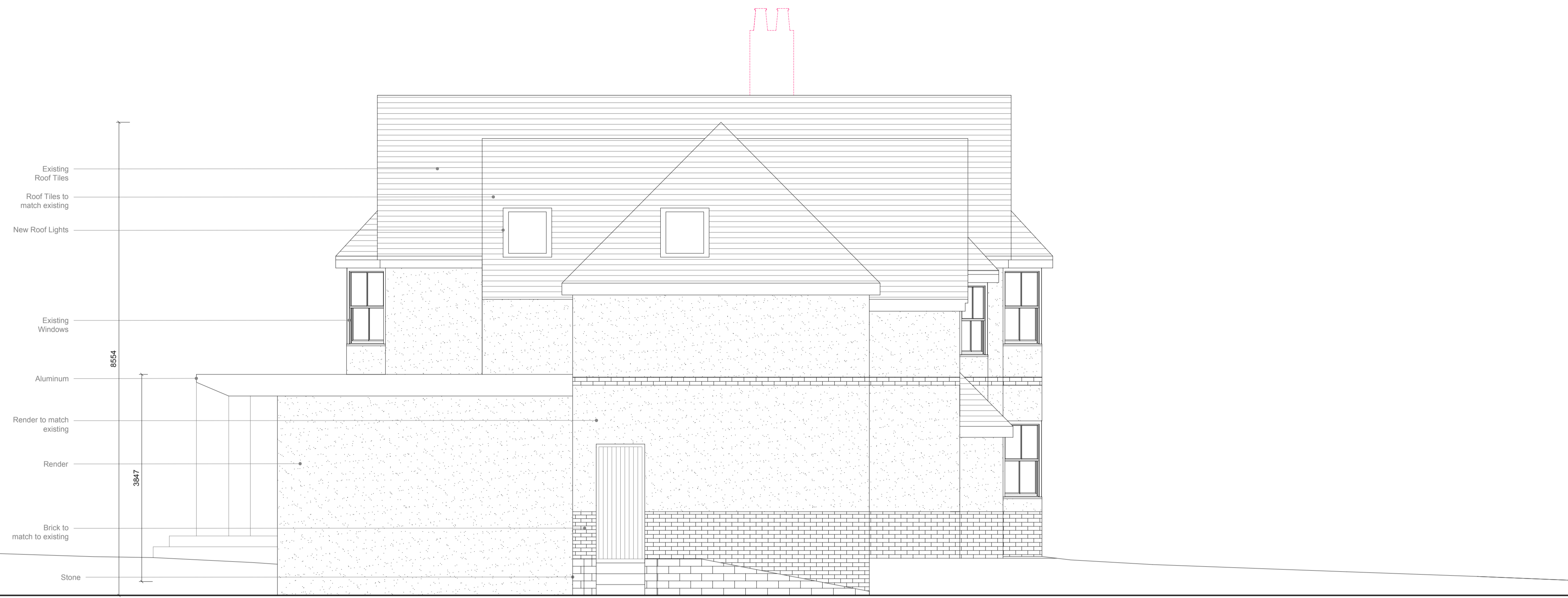
PREVIOUSLY APPROVED LEFT ELEVATION 1:50