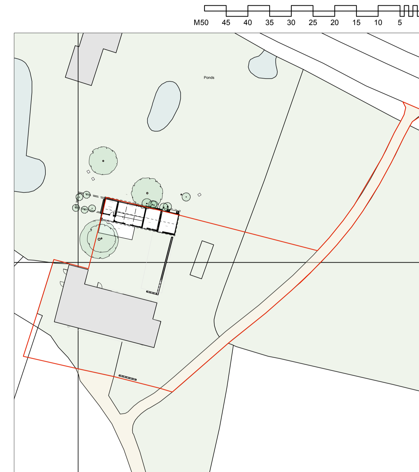
SITE BLOCK PLAN SCALE 1:500

General Notes 1. Do not scale this drawing. All dimensions to be as noted. Contractor to check all dimensions on site before carry out works. 2. This drawing is for the private and confidential use of the client for whom it was undertaken and it should not be reproduced in whole or in part or relied upon by third parties for any use without the express written authority of Beech Architects Limited.