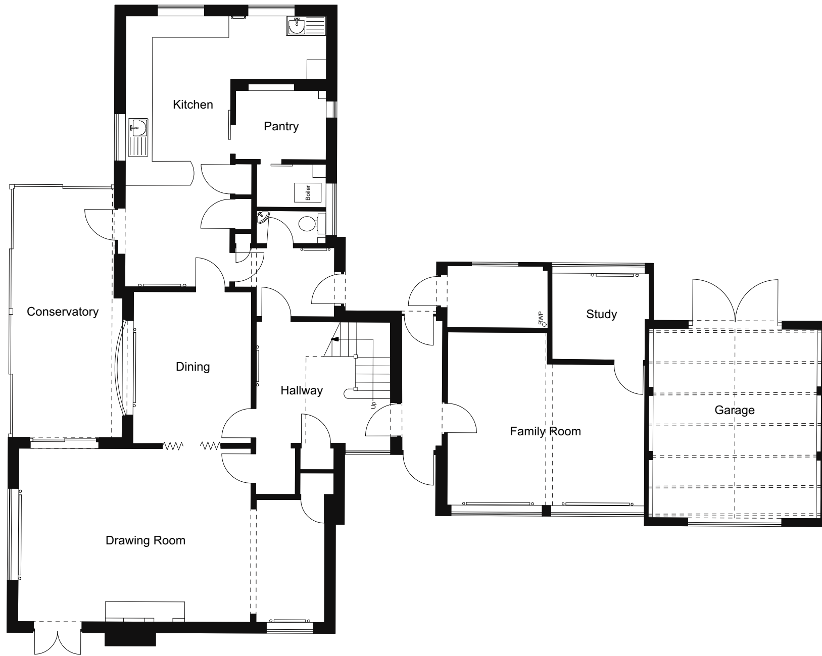
EXISTING GROUND FLOOR