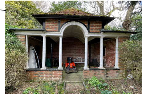
Colonnaded brick summer house behind plot 3 with vaulted ceiling to be retained