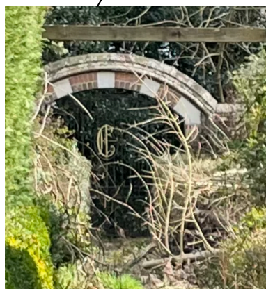
Rear boundary brick archway with wrought iron gate to left of plot 1 to be retained

FIRE APPLIANCE REVERSE SIDE TURNING HEAD