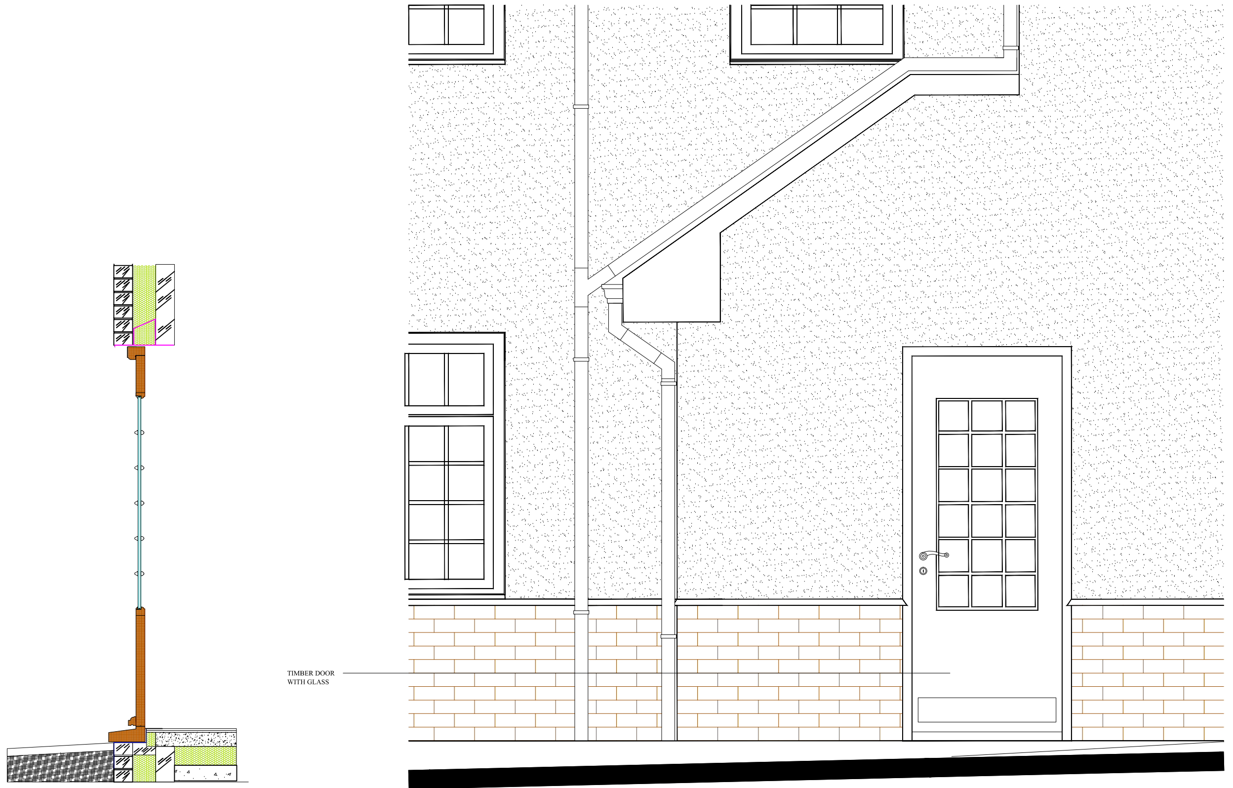
TYPICAL CENTRAL CROSS SECTION OF THE THE SIDE ENTRANCE