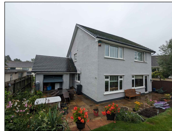
EXISTING PHOTO C FROM REAR OF PROPERTY NTS