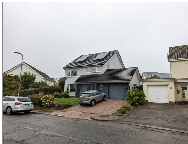
EXISTING PHOTO B FROM SIDE OF PROPERTY NTS