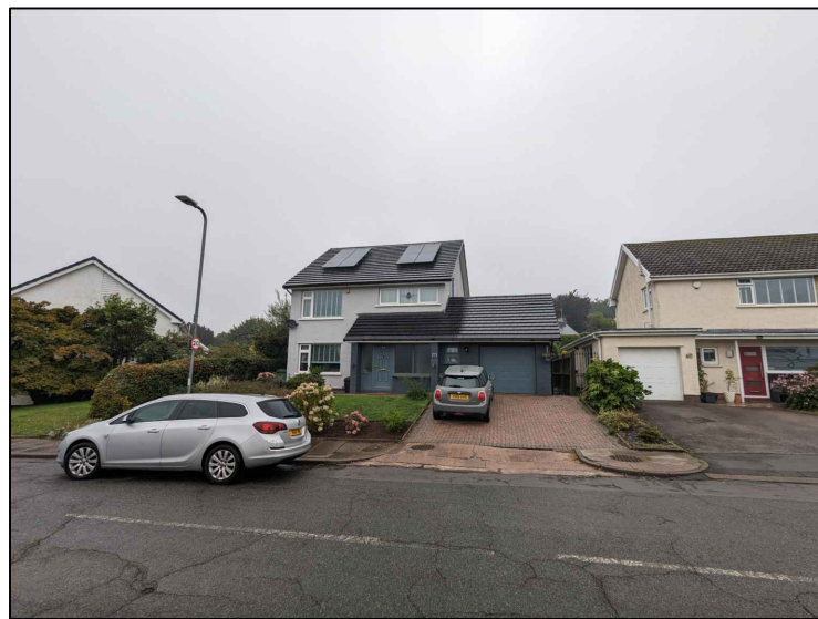
EXISTING PHOTO A FROM FRONT OF PROPERTY NTS