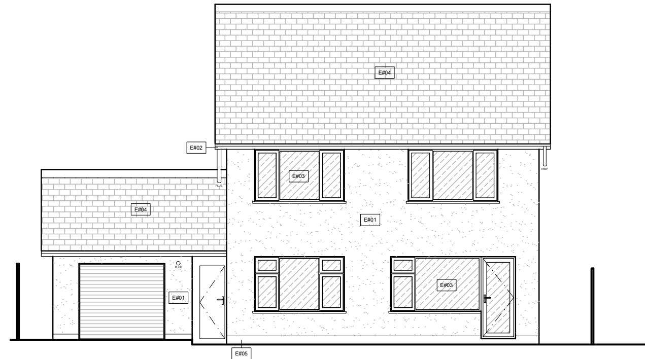
EXISTING ELEVATION A SCALE 1:100