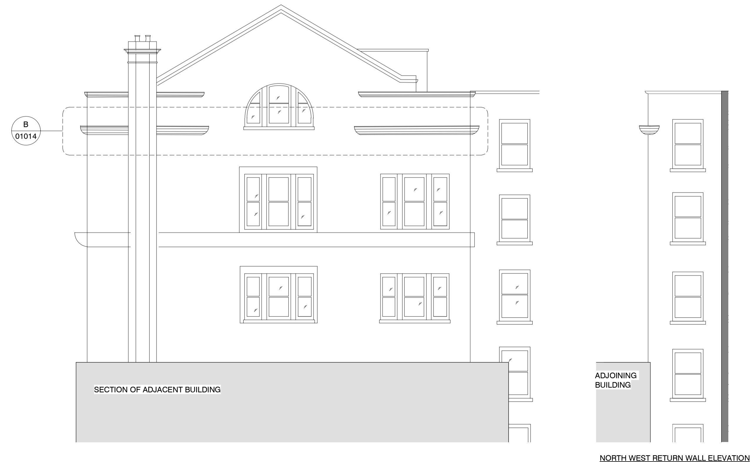
E Existing Elevation - North West 1 : 100