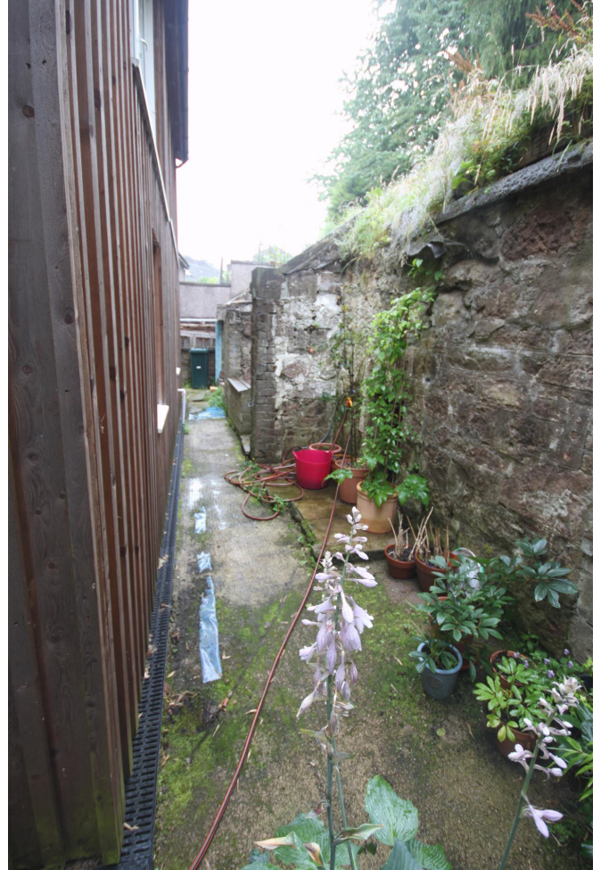
↑ View along rear of house looking North