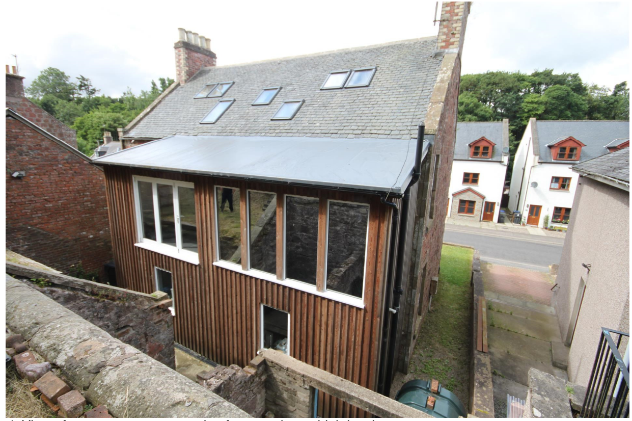
↑ View of two storey rear extension from garden at high level