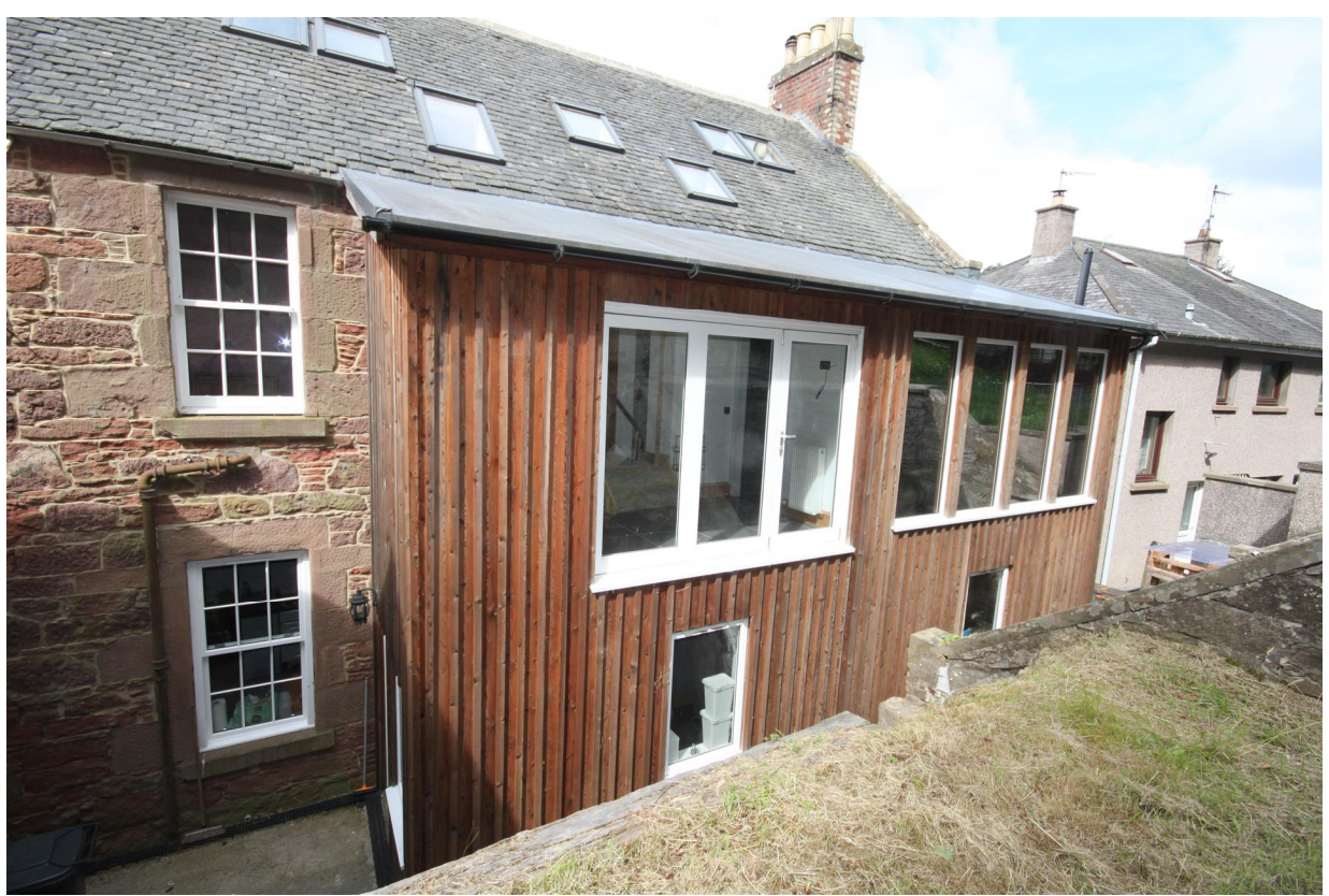
↑ View of two storey rear extension from garden at high level