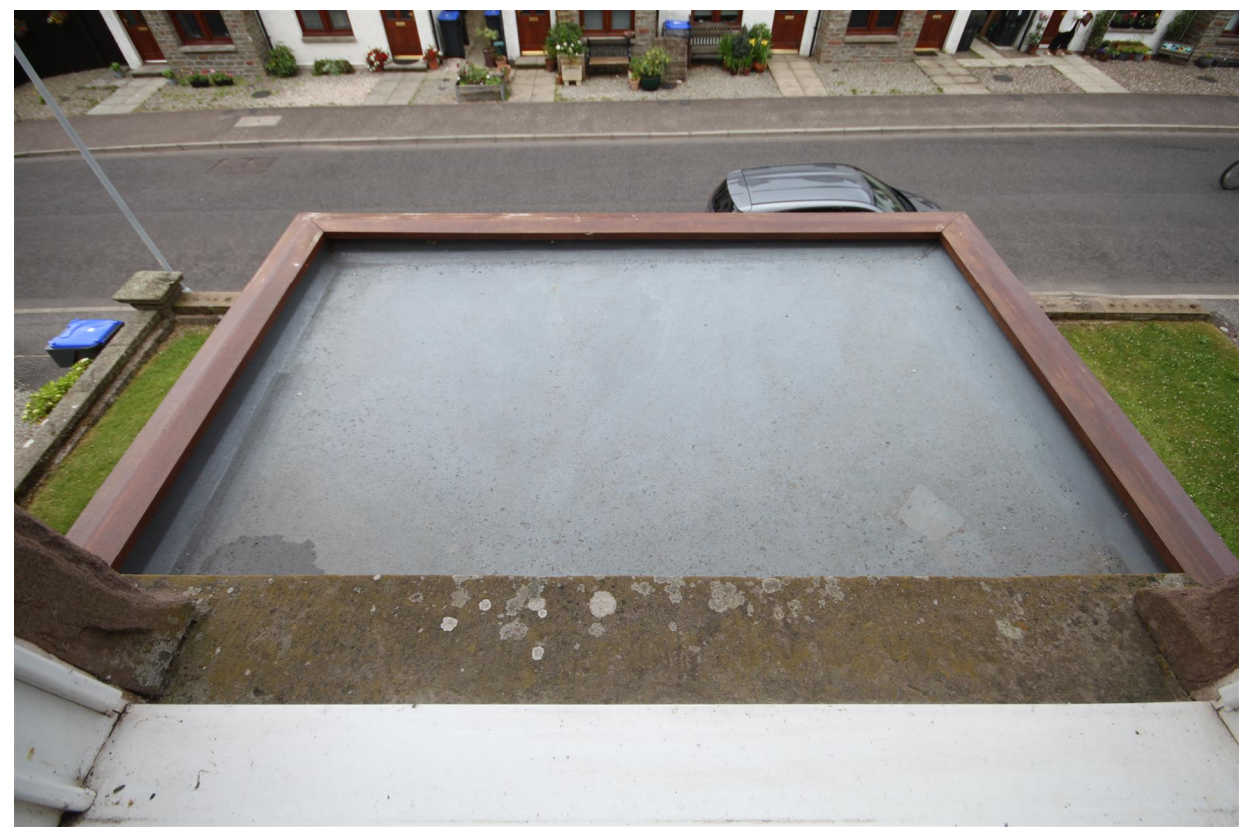
↑ View of porch roof from first floor bedroom window