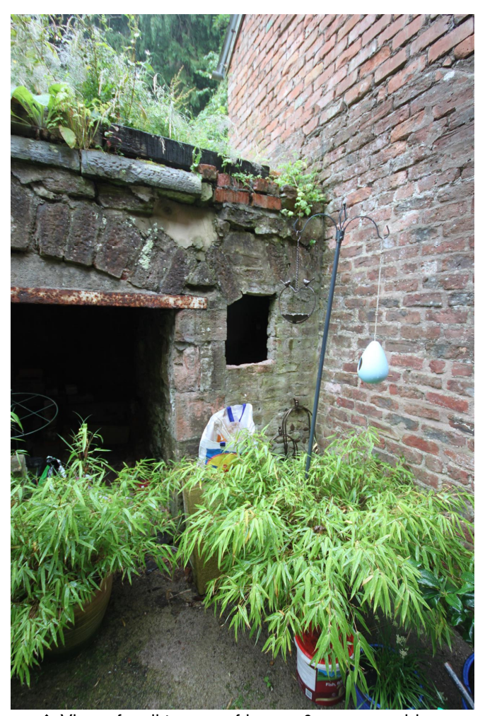
↑ View of wall to rear of house & garage gable