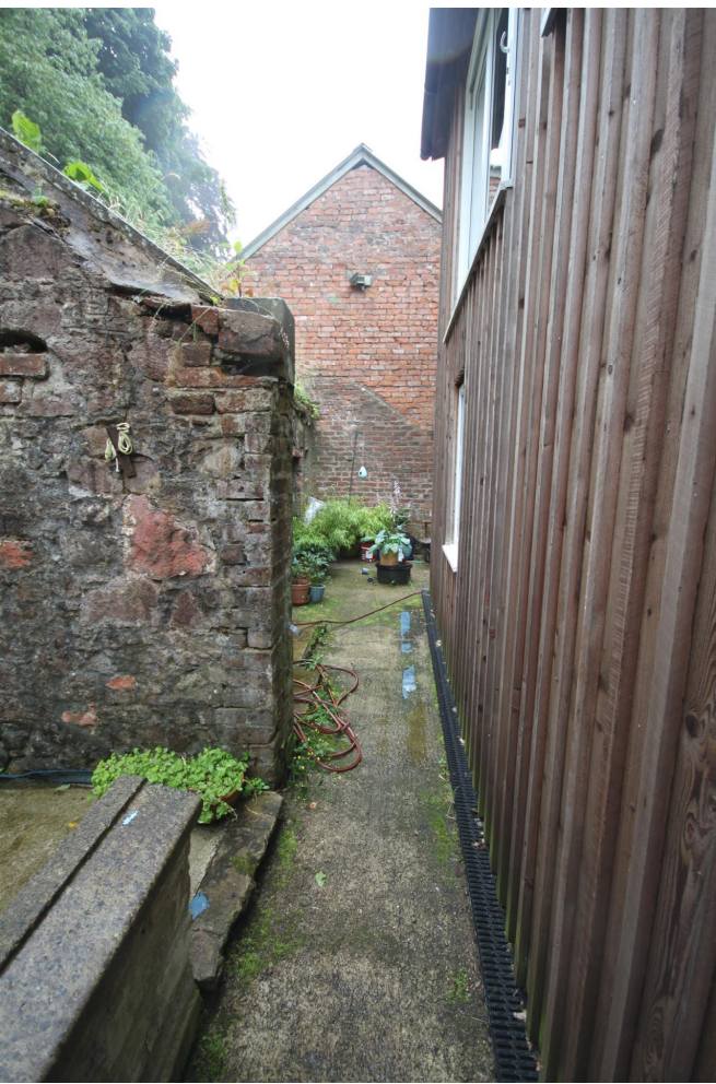
↑ View of rear of house & garage gable