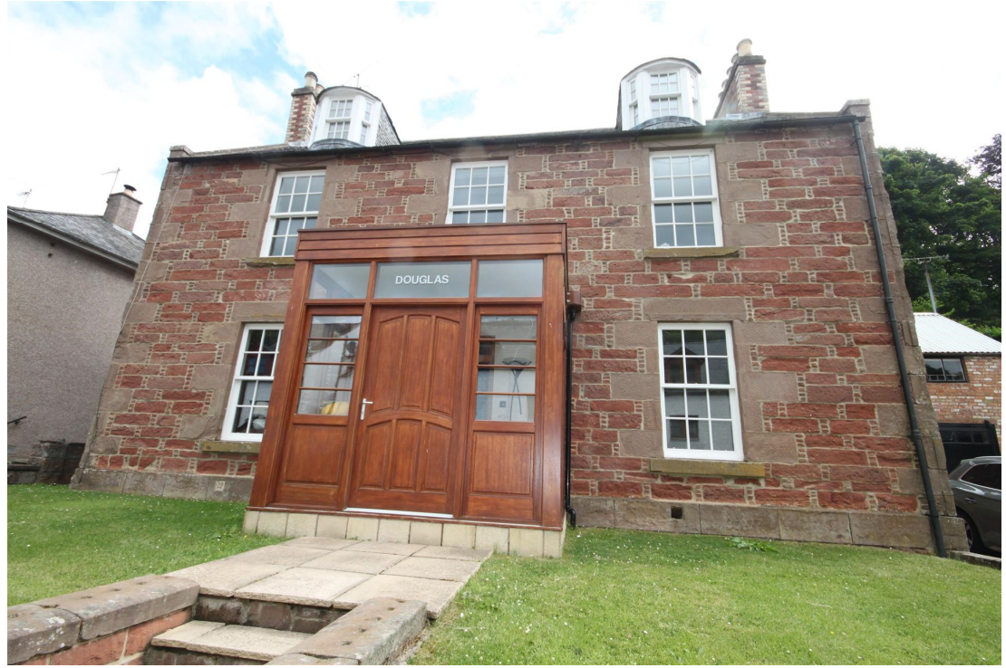
↑ View of house and porch from Burnett Street