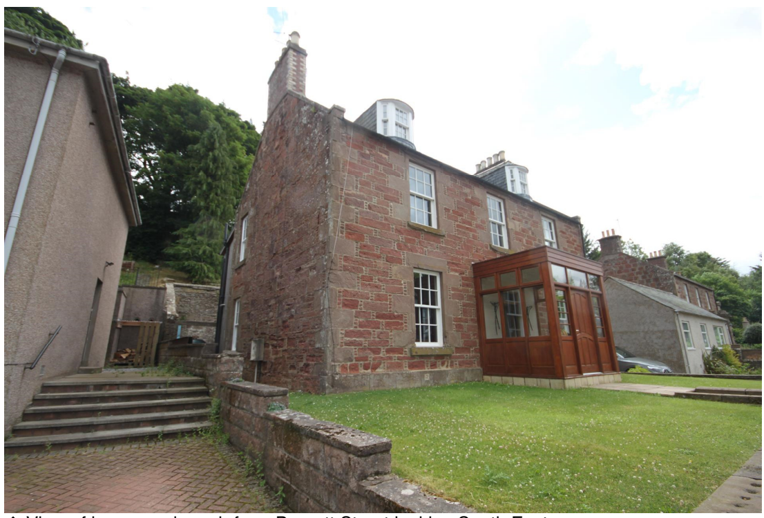
↑ View of house and porch from Burnett Street looking South East