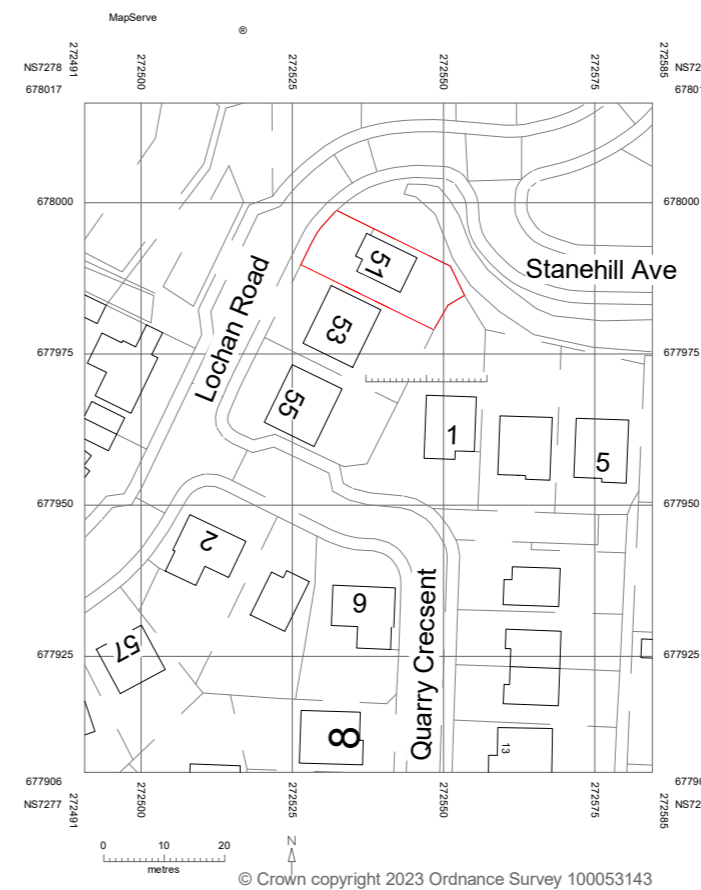
4 Existing Location Plan 1 : 1250