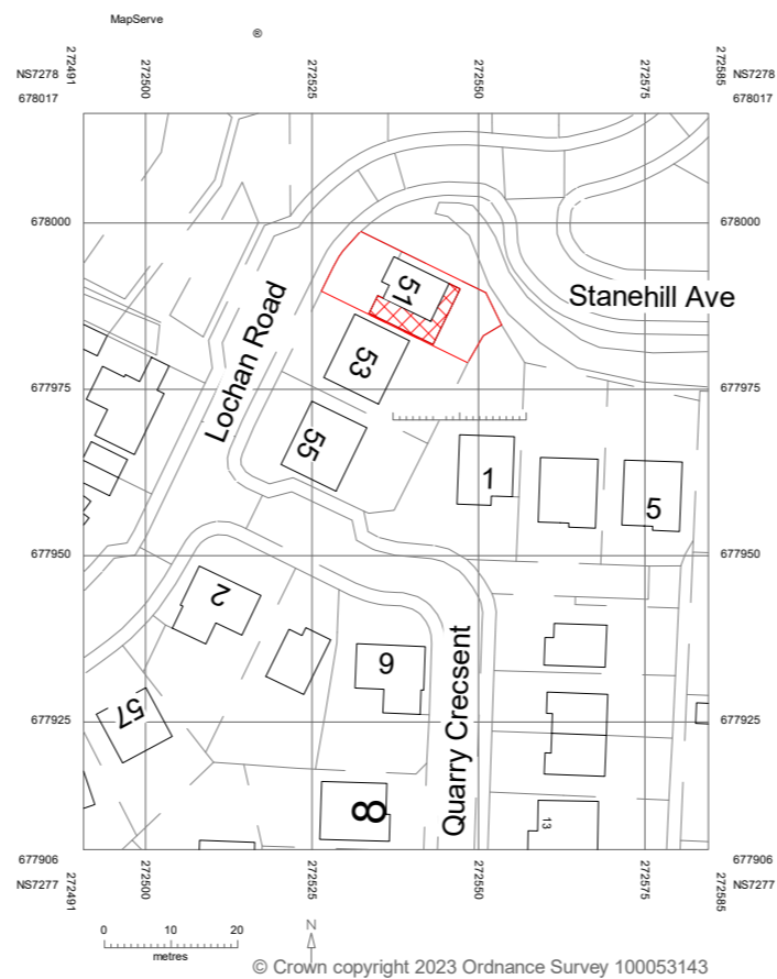
1 Proposed Block Plan 1250 1 : 1250

© Crown copyright 2023 Ordnance Survey 100053143