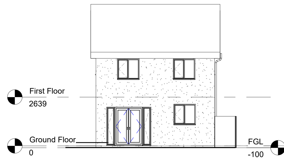
Existing Rear Elevation 1 : 100