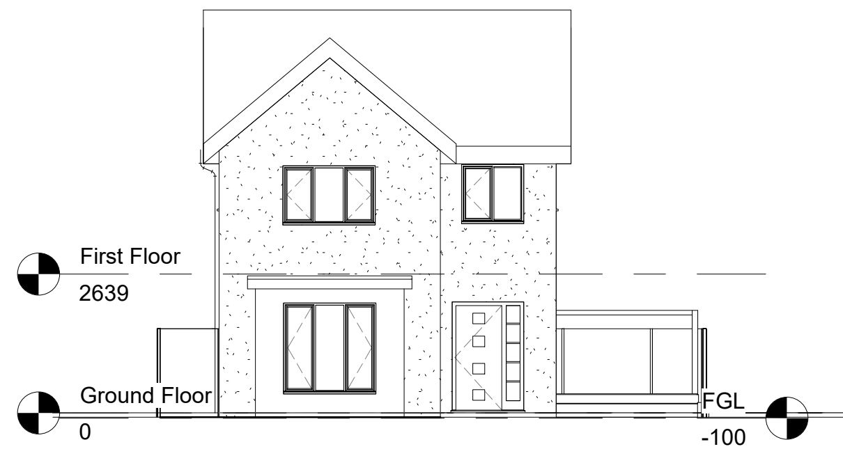
Existing Front Elevation 1 : 100