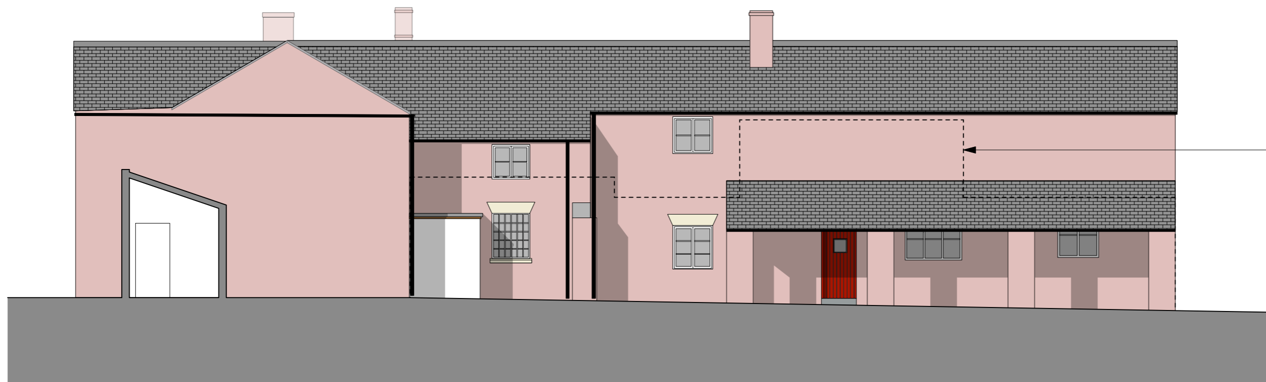
E04 Existing West Elevation