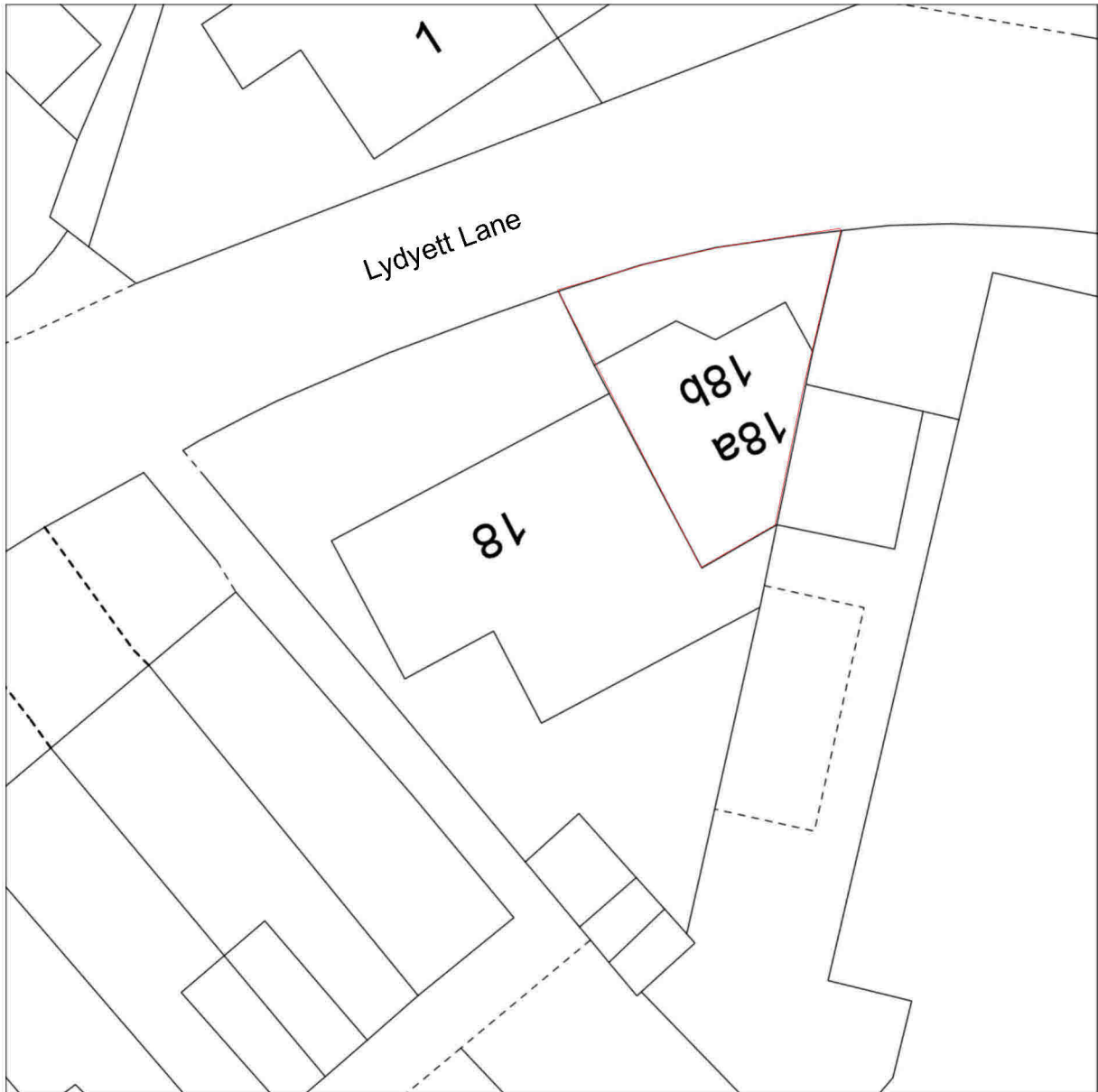
18b, Lydyett Lane, Barnton, Northwich