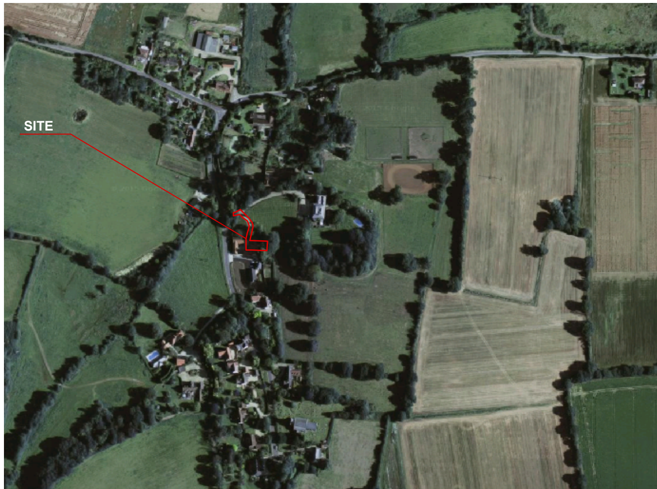
AERIAL VIEW - Not to Scale