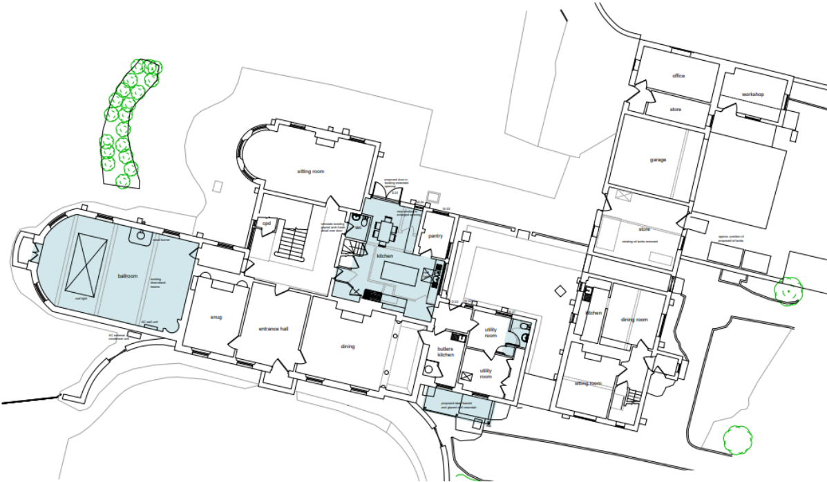
Ground floor plan previously approved

Previously approved plans under application DC/23/03181.