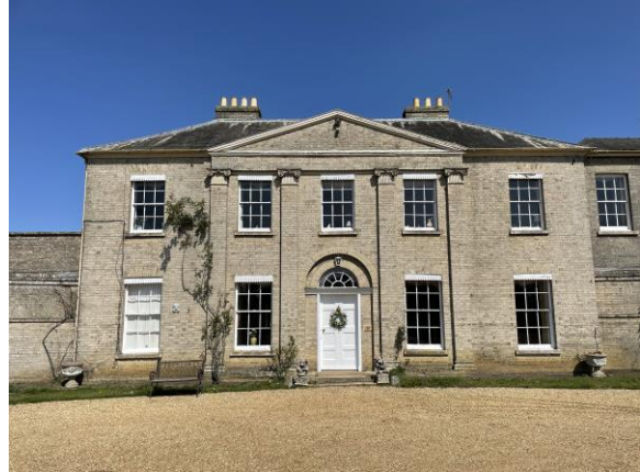
Front elevation of The Old Rectory