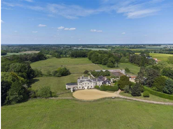
Overall site view