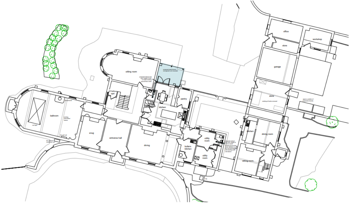
Proposed ground floor plan