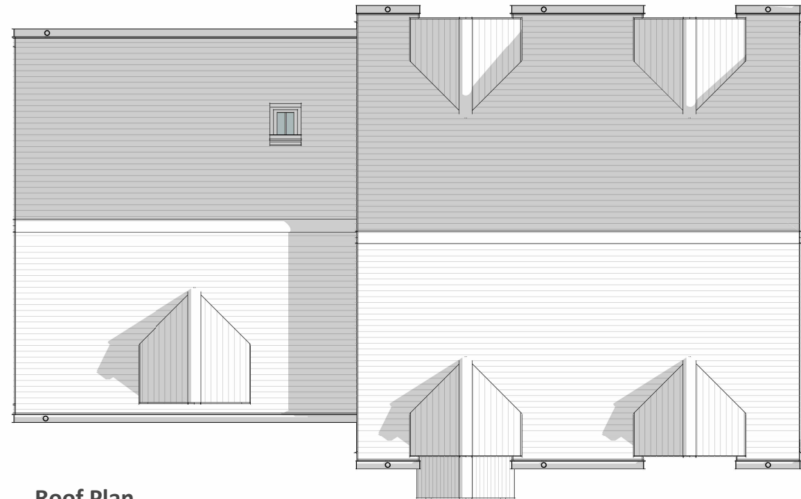
Roof Plan 1 : 100