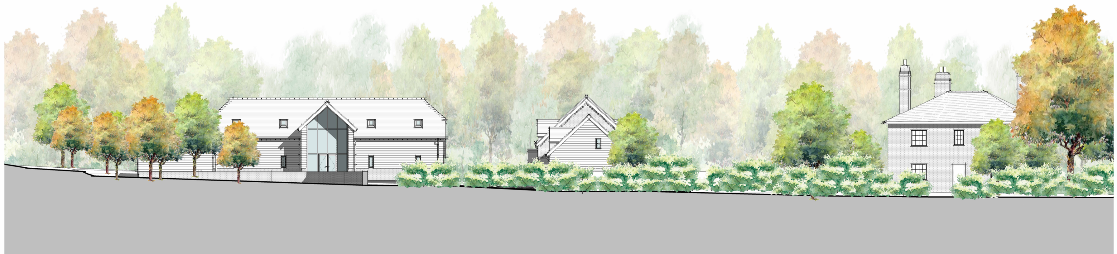
Proposed Site Section 1 : 200