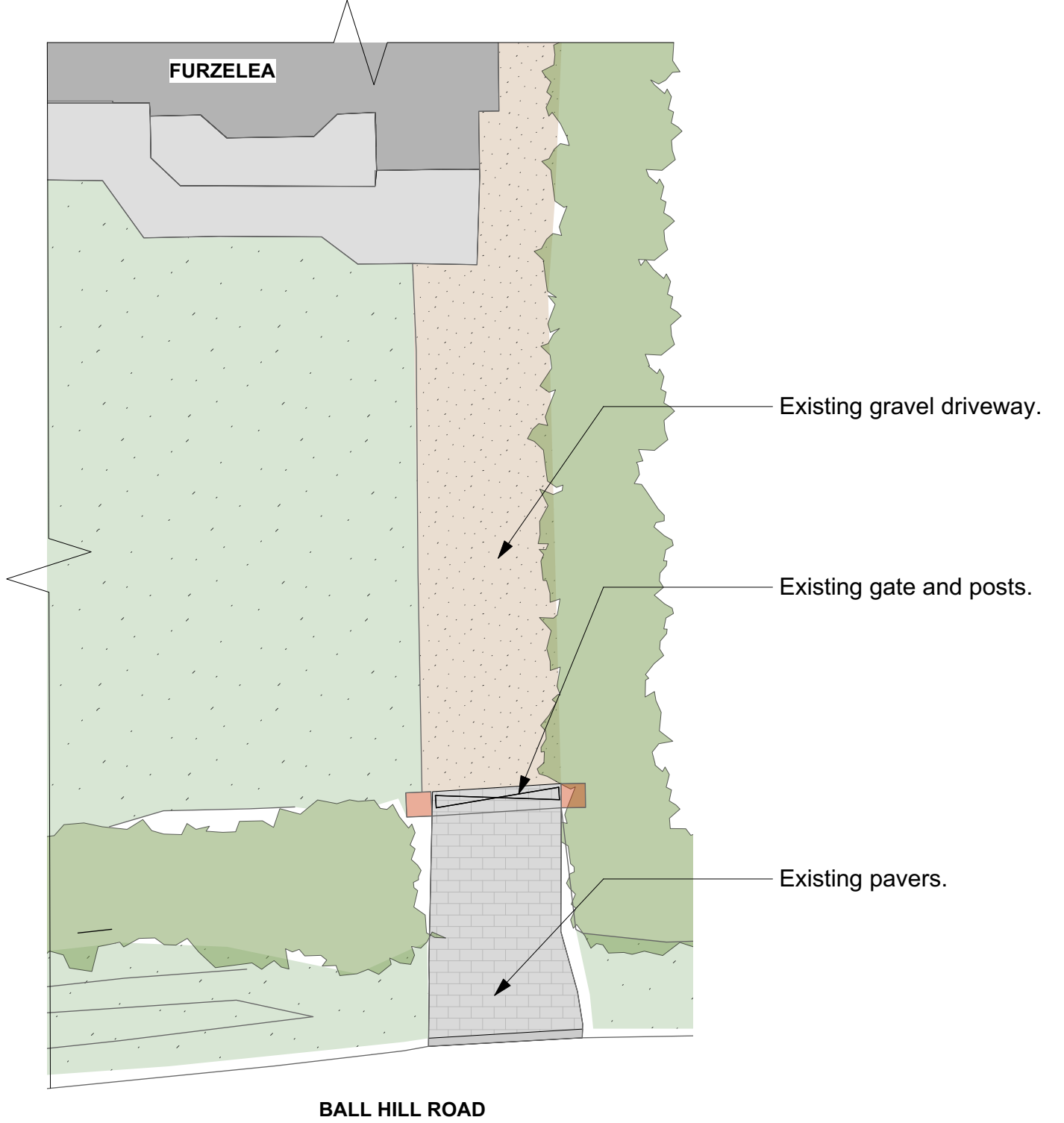
Key Plan: Existing Site Layout