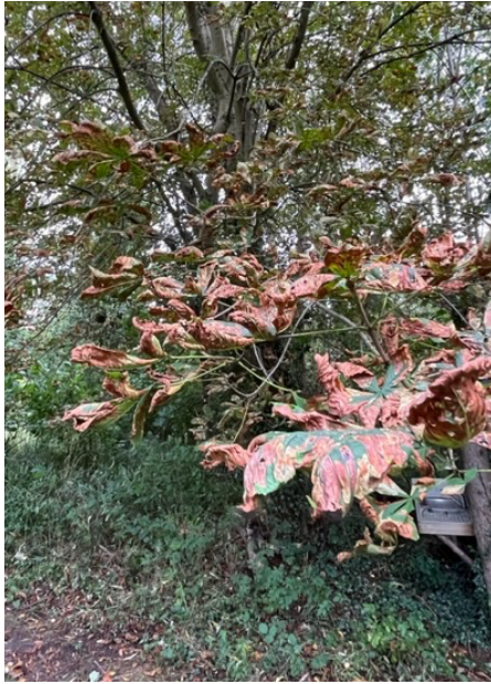
Tree B Horse Chestnut