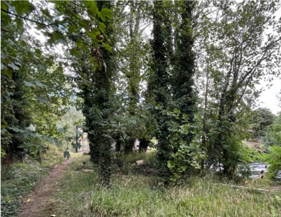
Trees C1, C2 Sycamore