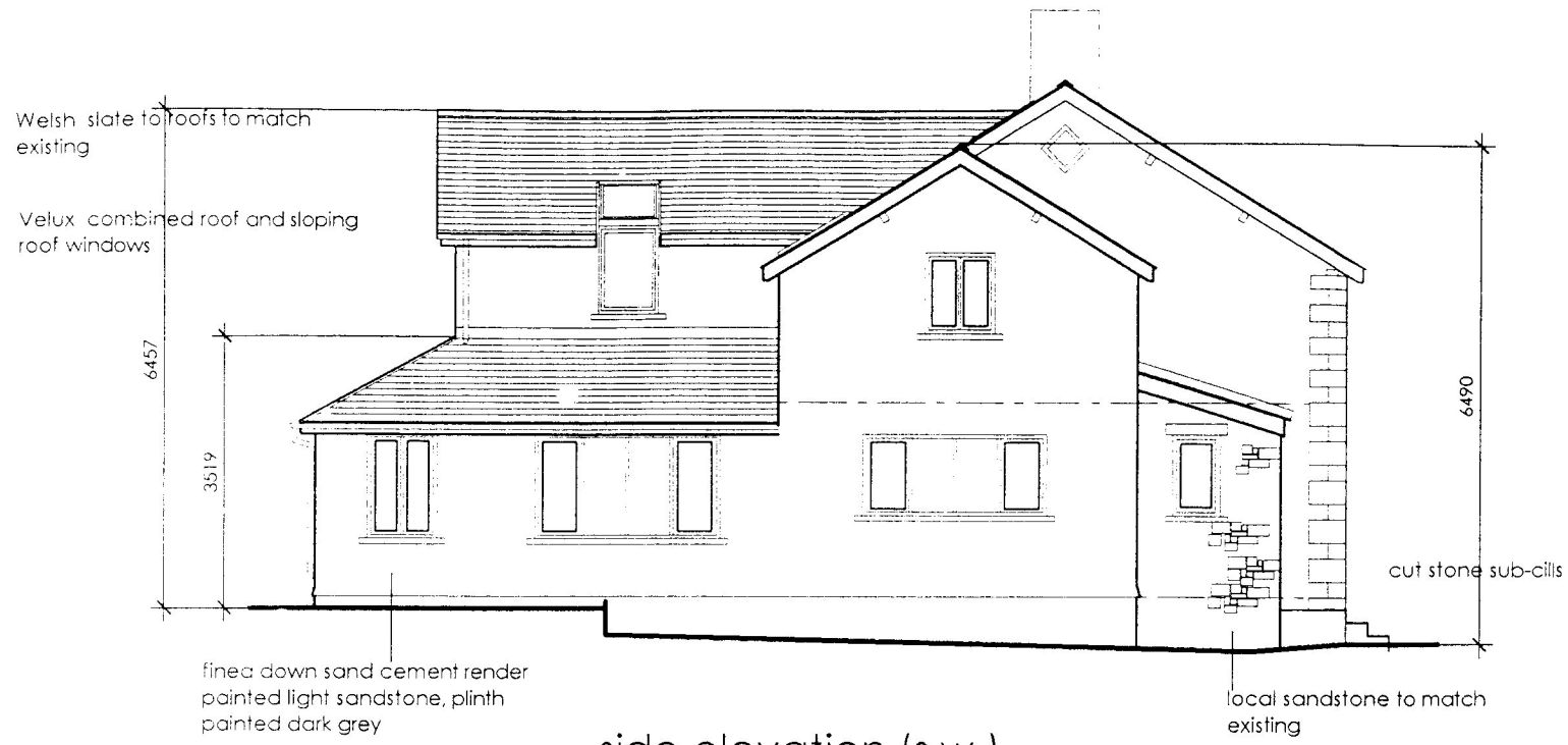
side elevation (s.w.)

Note Do not scale this drawing. This drawing is copyright.