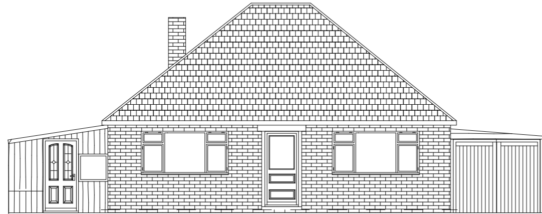
South East Elevation (Front)

The recipient is responsible for verifying the correctness and completeness of the information issued. This should be done by consulting all relevant documents supplied during the course of the project and by confirming dimensions on site. It is the responsibility of the recipient to ensure they have the most up to date information. This plan has been prepared to meet professional standards and practices as best as possible. However, building regulations and requirements vary with location and can change from time to time. Before starting construction the contractor must review and be responsible for all dimensions and other details and should review plans to ensure they meet current requirements. The contractor assumes full responsibility to verify the conditions, dimensions, and structural details of the building, and assumes full liability for any problems that may arise due to possible errors on these plans.