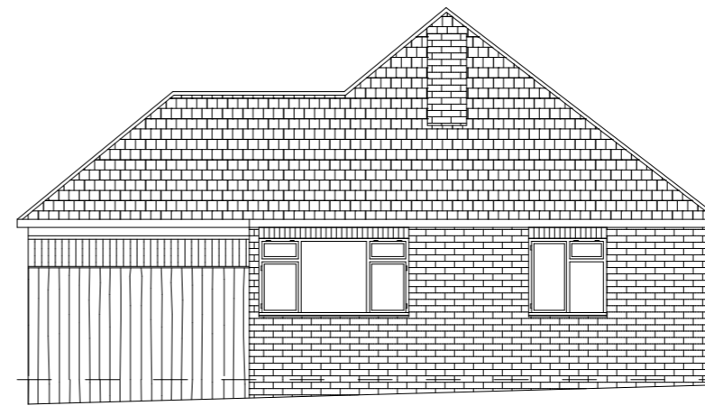
South West Elevation (Side)