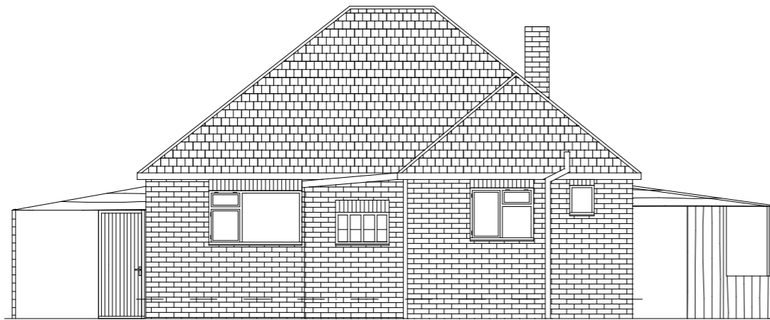
North West Elevation (Rear)