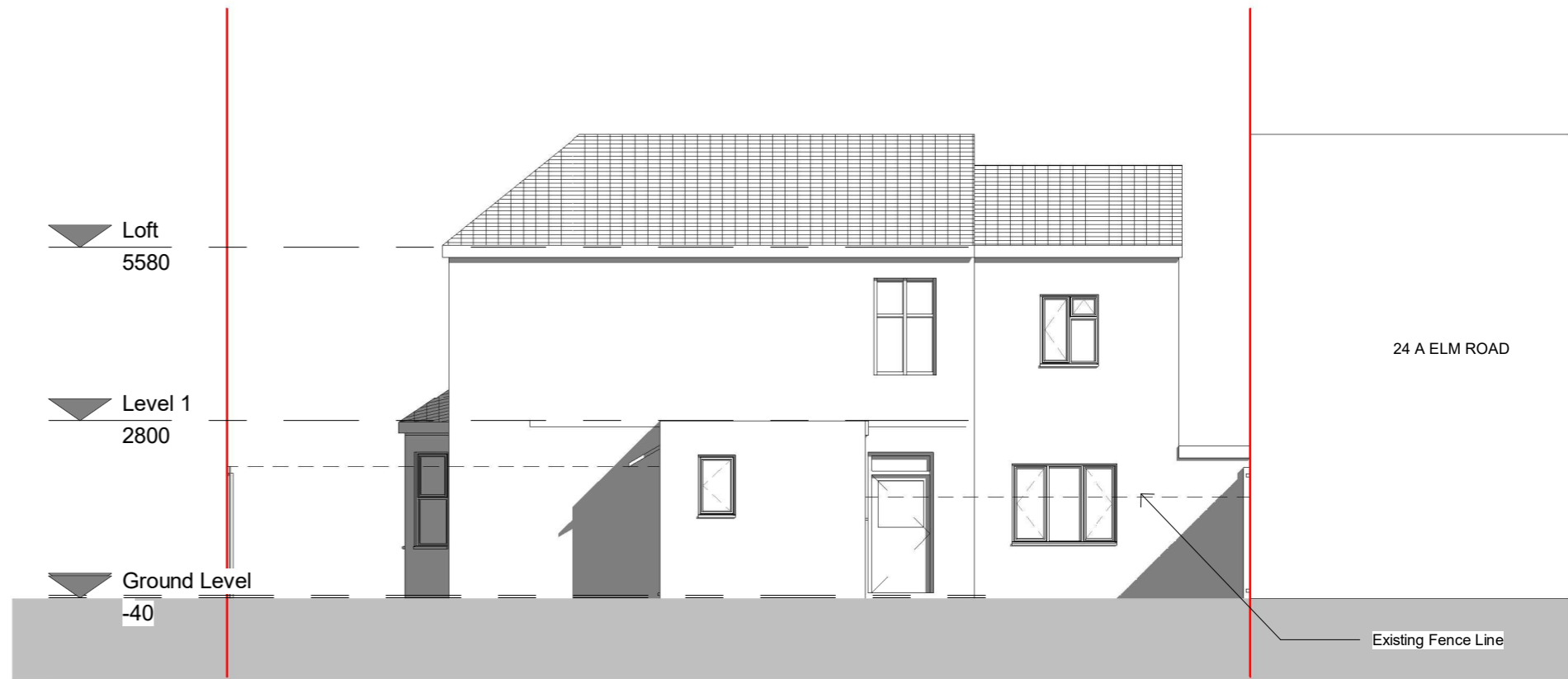
1 Side elevation 1 - Existing 1 : 100