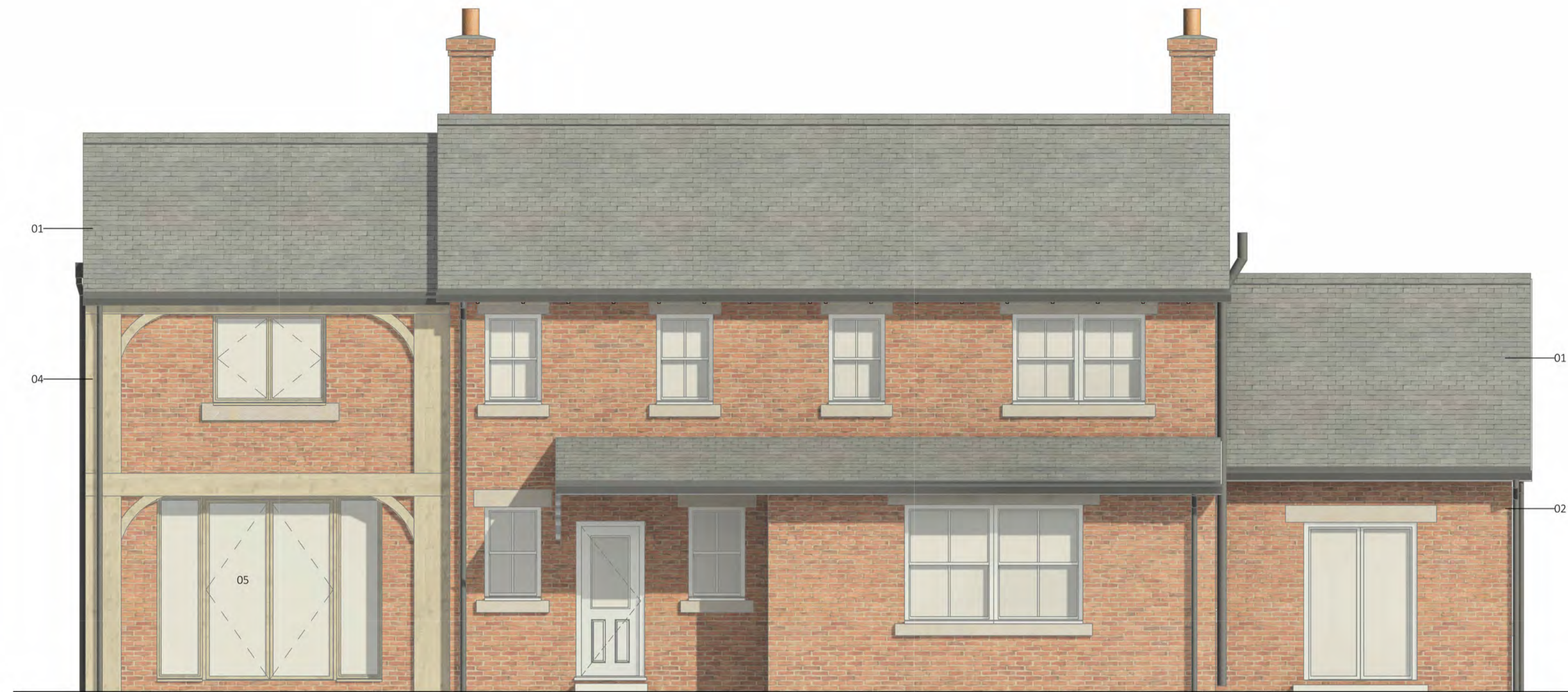
Proposed North Elevation 1 : 50