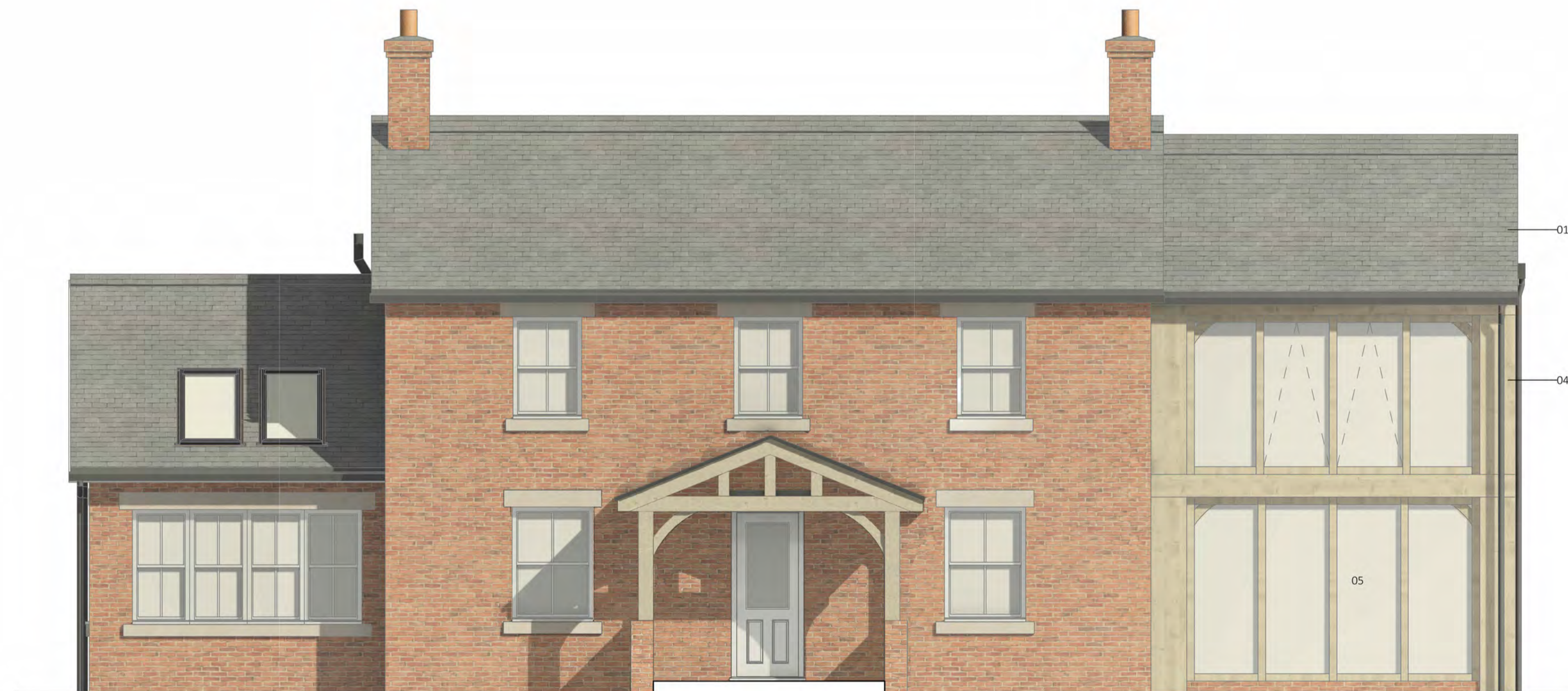
Proposed South Elevation 1 : 50