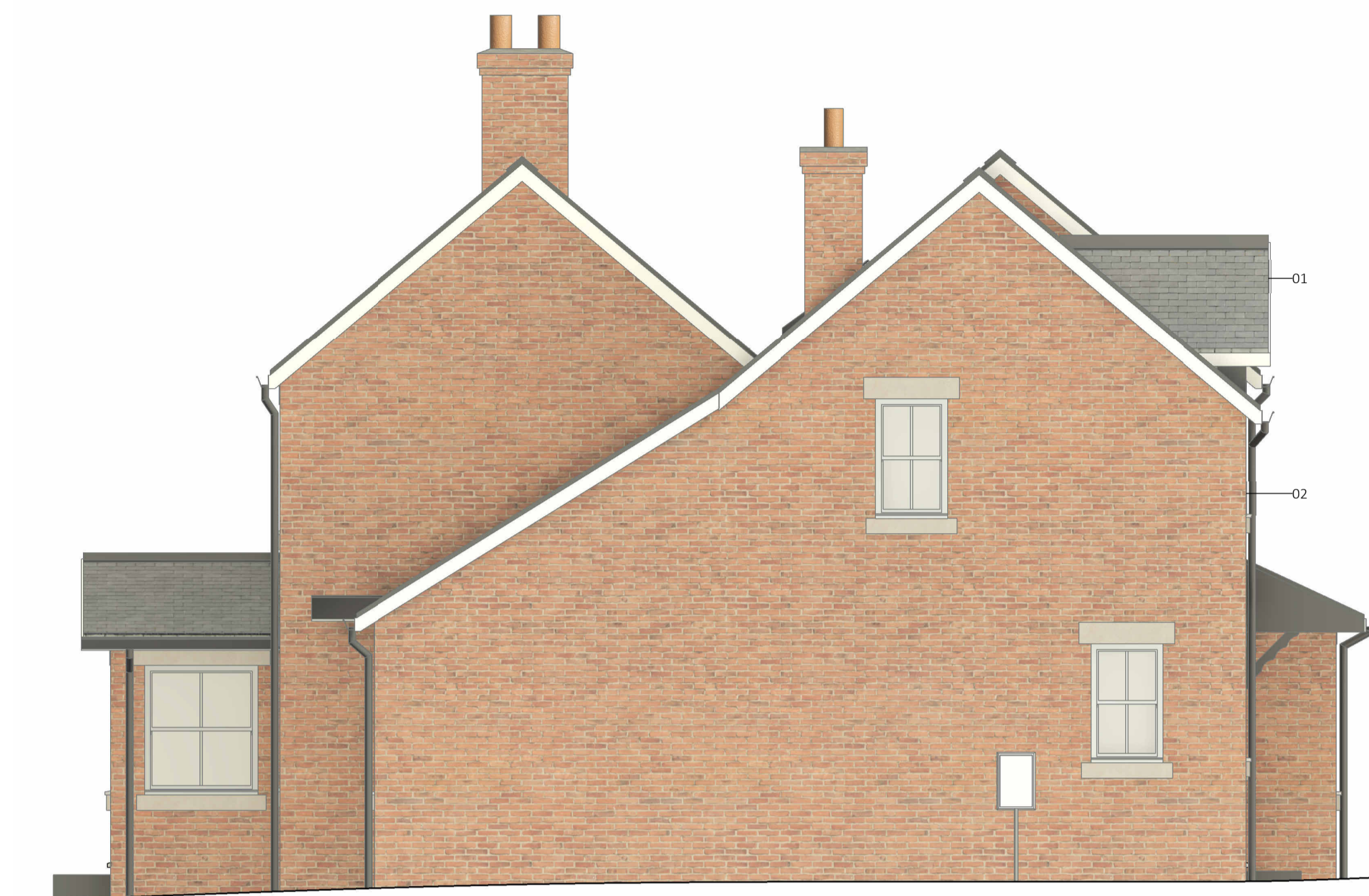
Existing East Elevation 1 : 50