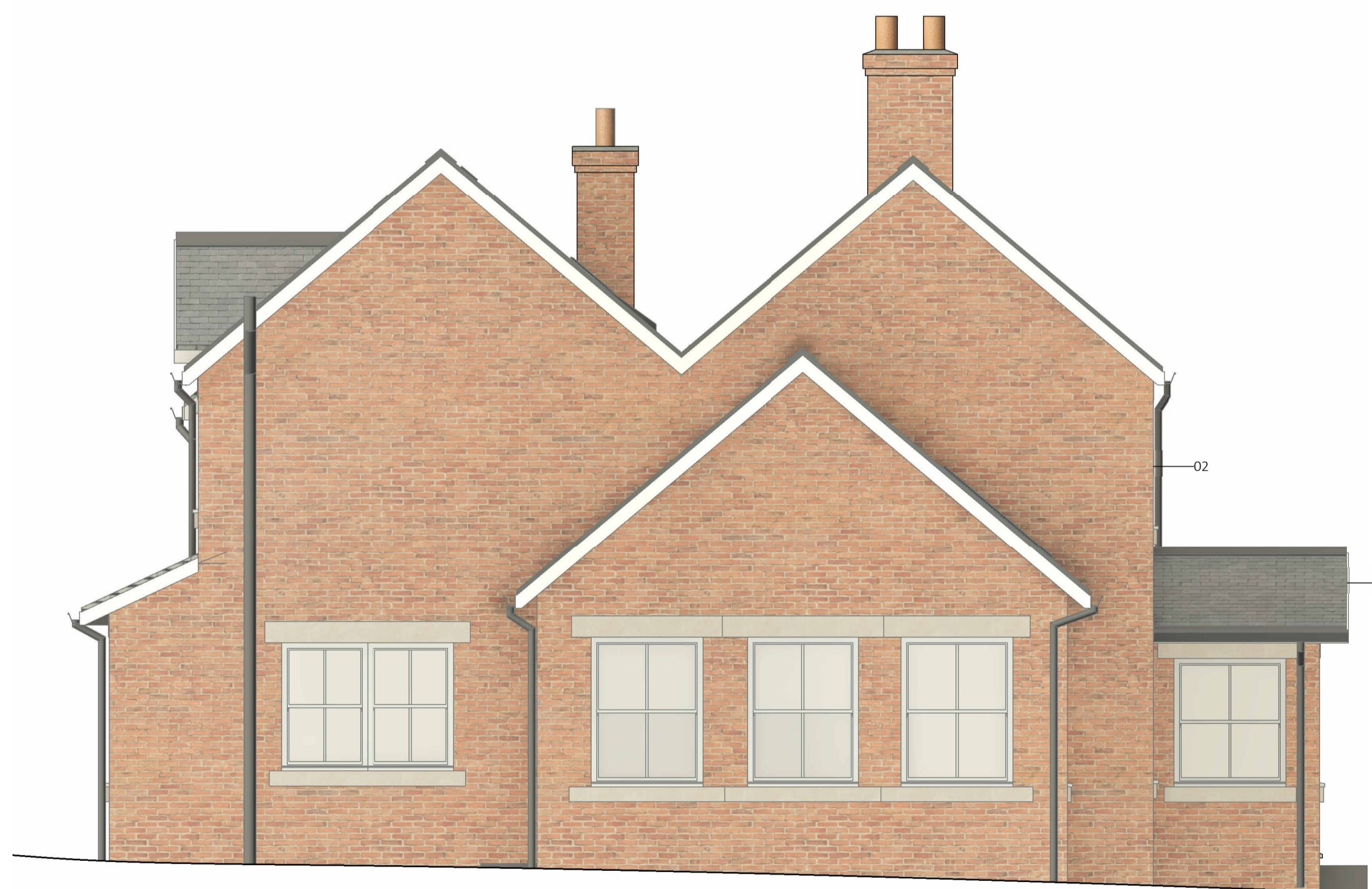
Existing West Elevation 1 : 50