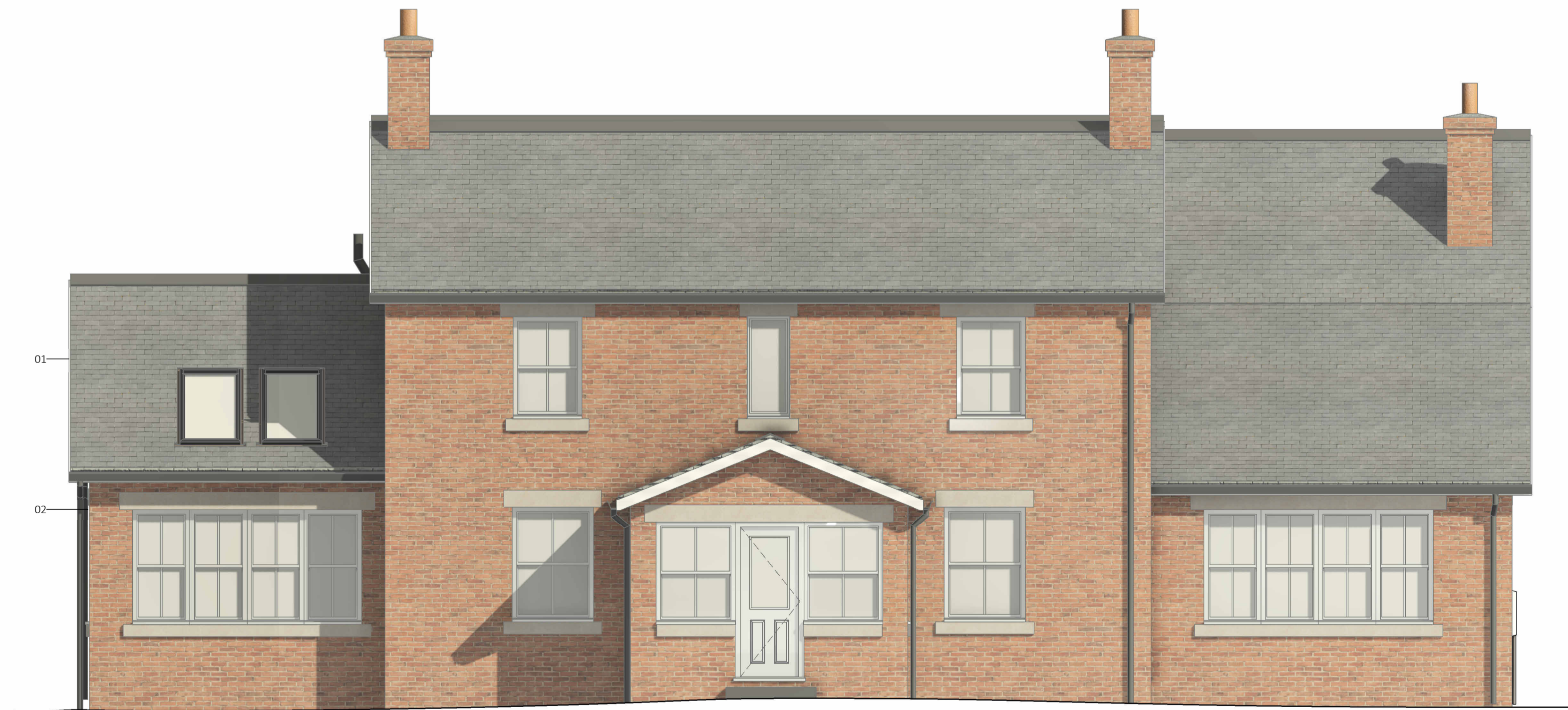
Existing South Elevation 1 : 50