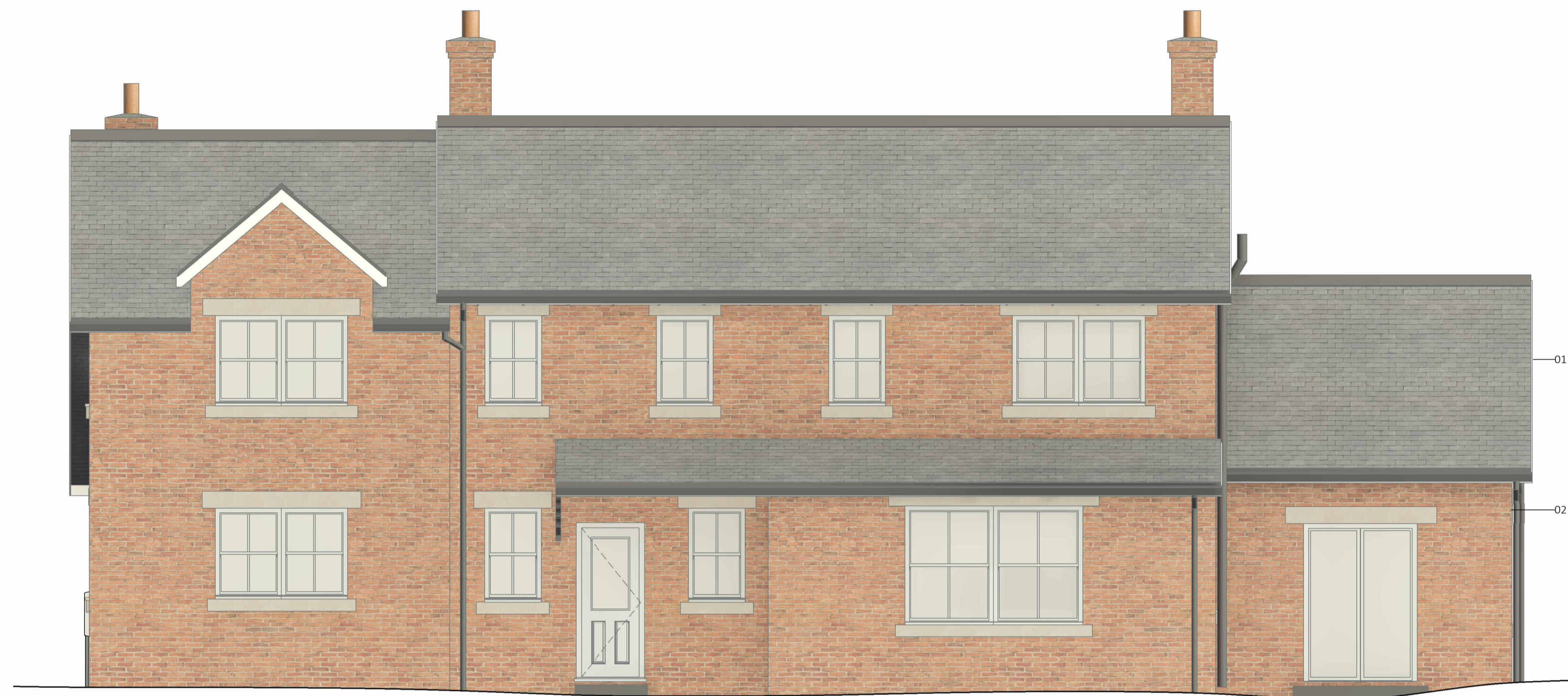
Existing North Elevation 1 : 50