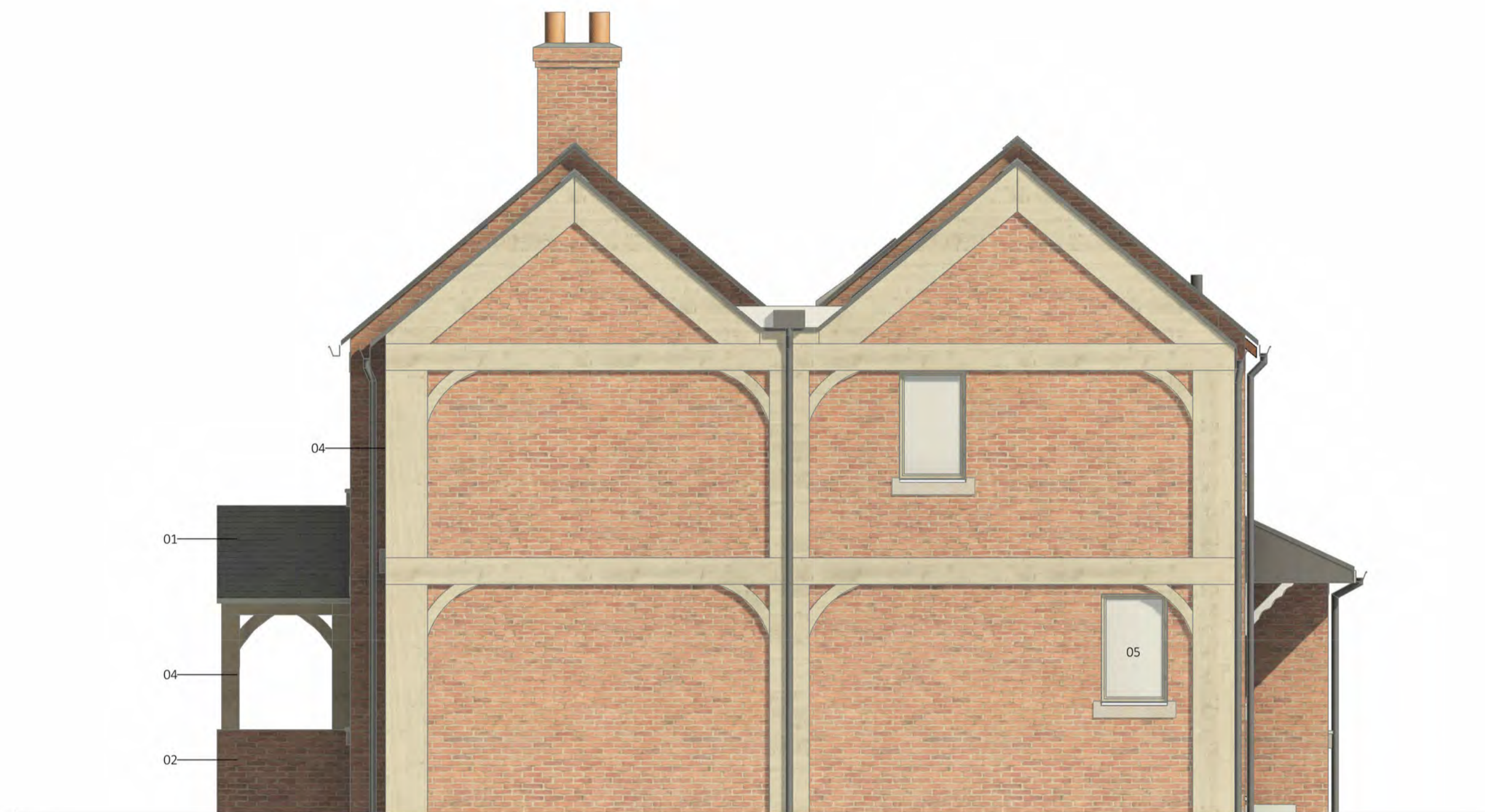
Proposed East Elevation 1 : 50