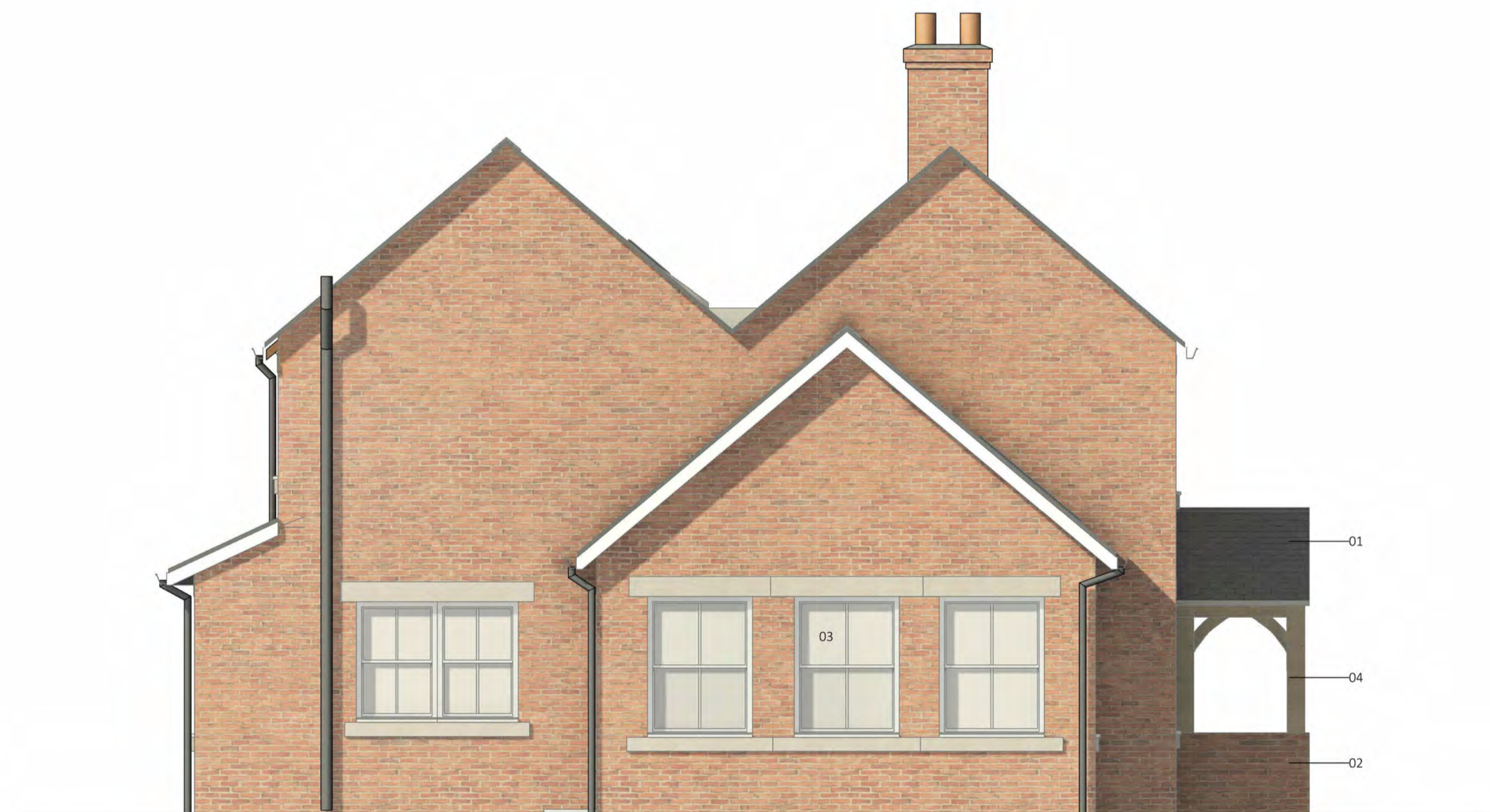
Proposed West Elevation 1 : 50