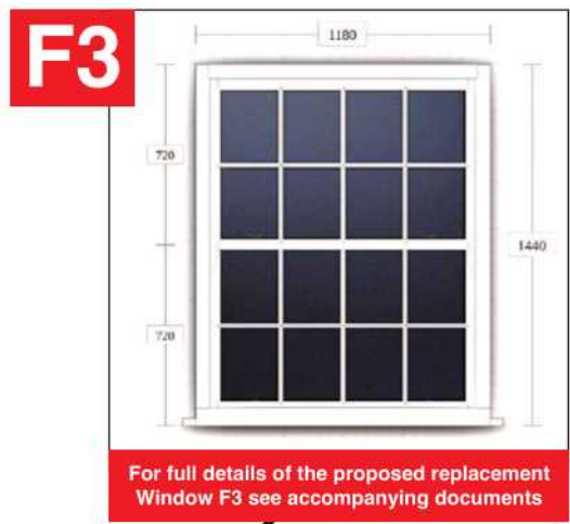
For full details of the proposed replacement Window F3 see accompanying documents