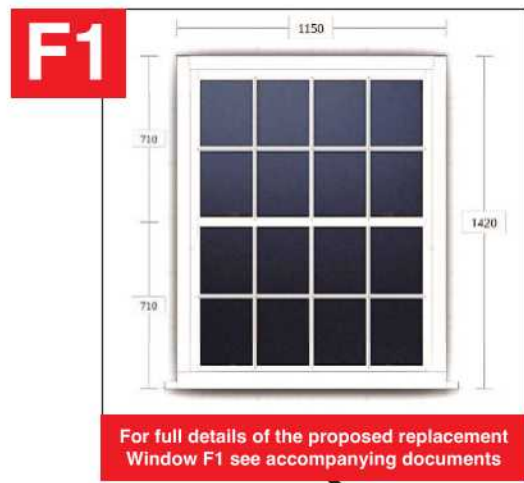
For full details of the proposed replacement Window F1 see accompanying documents