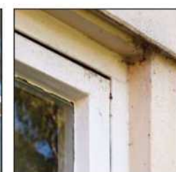
Frame and sash construction uses traditional jointing methods

SEE FULL DETAILS OF PROPOSED REPLACEMENT WINDOWS IN SEPARATE DOCUMENTS THAT ARE PART OF THIS APPLICATION.