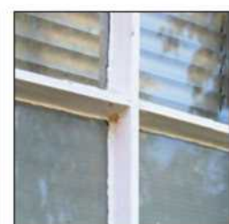
Traditional window bars retaining the glass