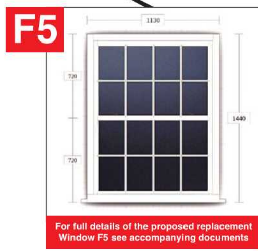
For full details of the proposed replacement Window F5 see accompanying documents

SEE FULL DETAILS OF PROPOSED REPLACEMENT WINDOWS IN SEPARATE DOCUMENTS THAT ARE PART OF THIS APPLICATION.