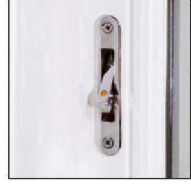
Child safety features