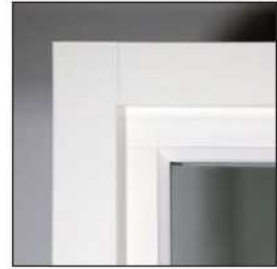
4-coat finishing process