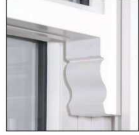
Horn detail to sash