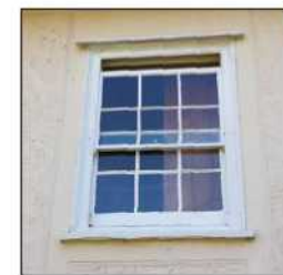
Traditional design style with two vertically sliding sashes

Features of the existing timber window are shown here; these features are included in the proposed replacement windows (shown left) and are detailed in the documents that accompany the application.