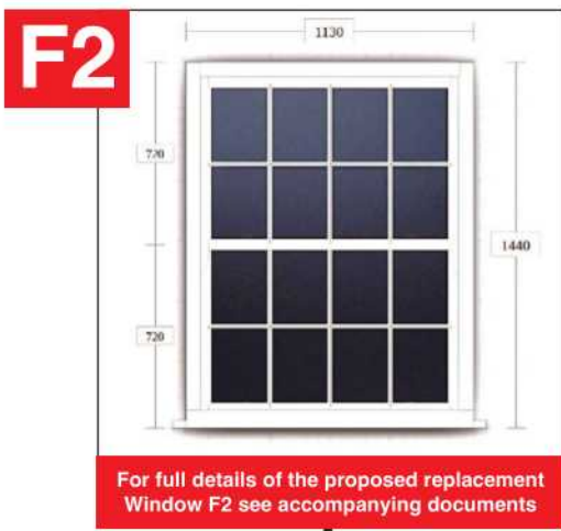
For full details of the proposed replacement Window F2 see accompanying documents