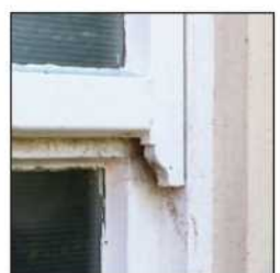
Horn details at the bottom of the top sash