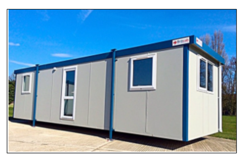
Typical appearance of portable cabins – source ukcabins.com

Below we have provided details of the typical appearance of portable buildings that are likely to be present on the site and to be used for the purposes of production offices.