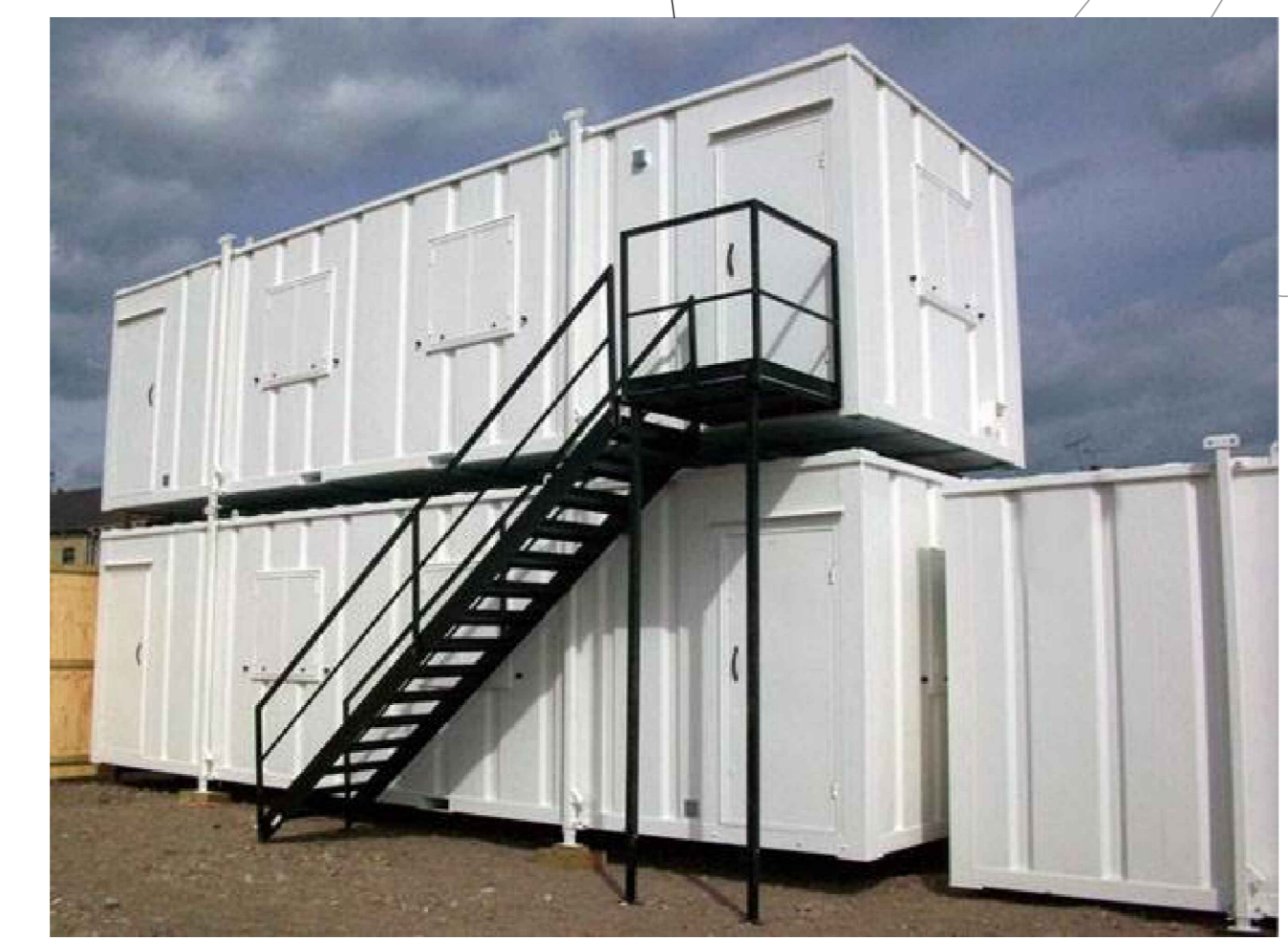
EXAMPLE IMAGE OF A DOUBLE STACKED WELFARE FACILITY