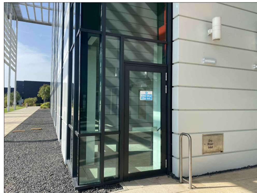
Example of door which will be installed. All new doors to match existing specification.