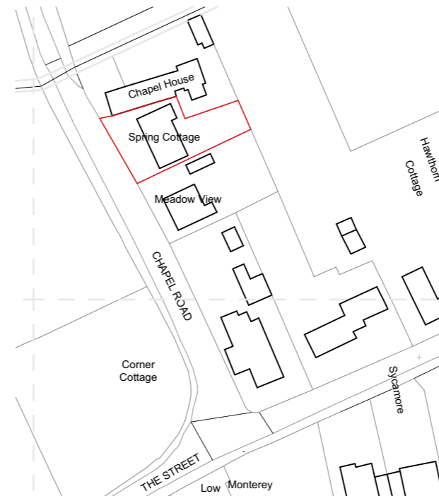
Location Plan 1:1250 - A3

Mapping contents © Crown copyright and database rights 2023 Ordnance Survey 100035207 Amendments: Changes made as requested by client Date: 01.09.23 Rev: A