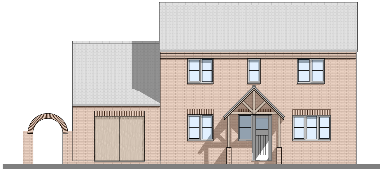
Existing South West Elevation 1:100 - A3