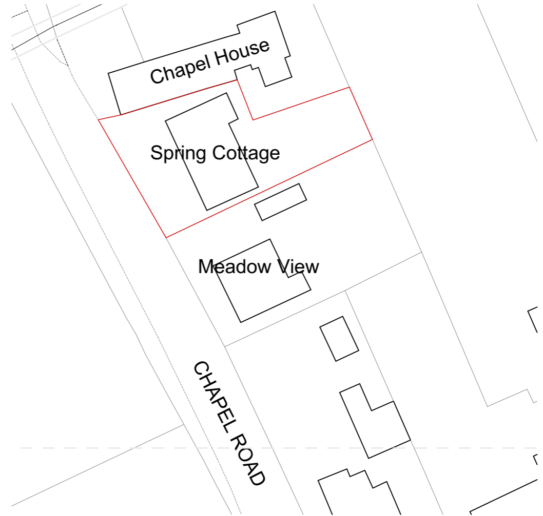
Site Plan 1:500 - A3