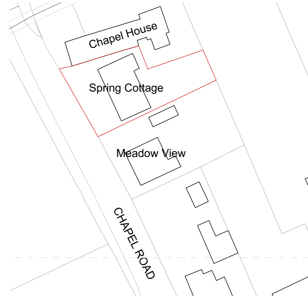
Site Plan 1:500 - A3