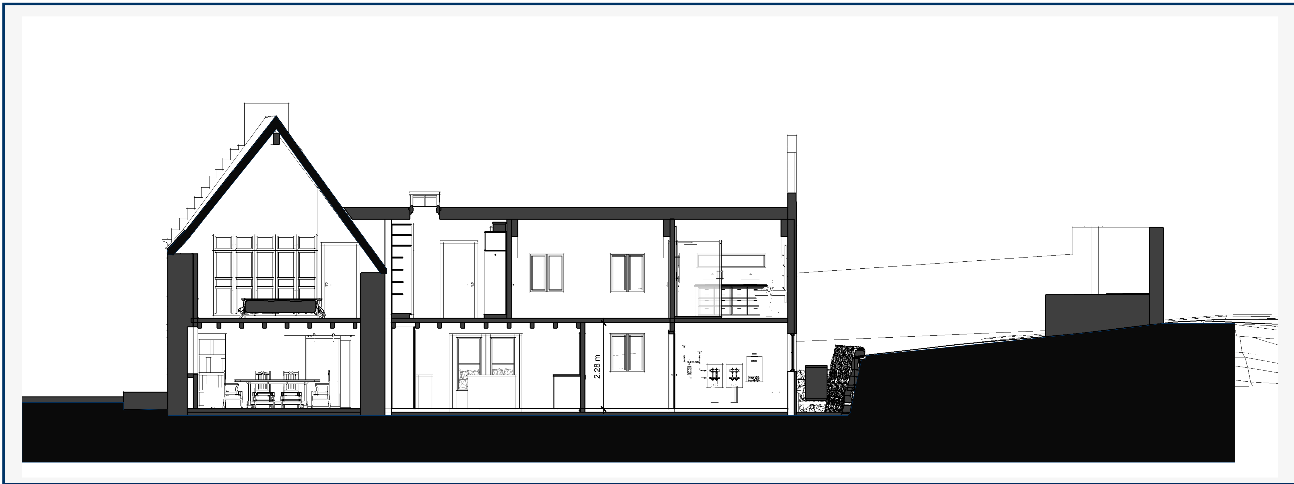
E Proposed Section 1 A3.7 1:50 @ A1