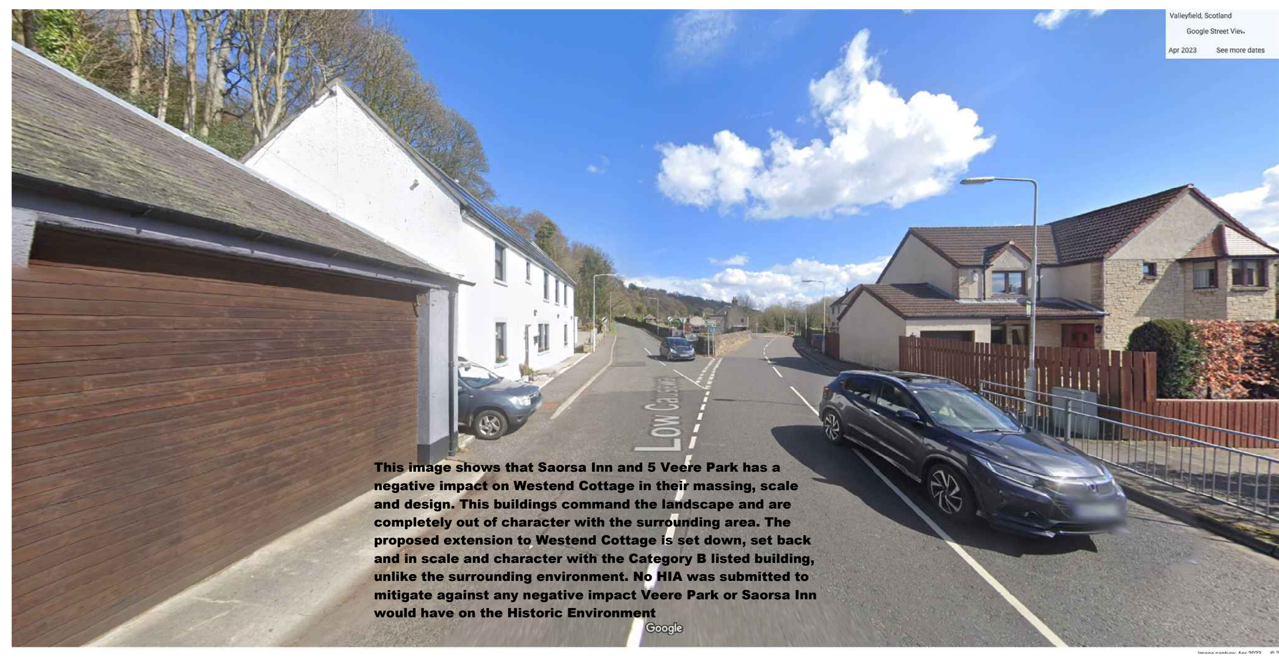
This image shows that Saorsa Inn and 5 Veere Park has a negative impact on Westend Cottage in their massing, scale and design. This buildings command the landscape and are completely out of character with the surrounding area. The proposed extension to Westend Cottage is set down, set back and in scale and character with the Category B listed building, unlike the surrounding environment. No HIA was submitted to mitigate against any negative impact Veere Park or Saorsa Inn would have on the Historic Environment