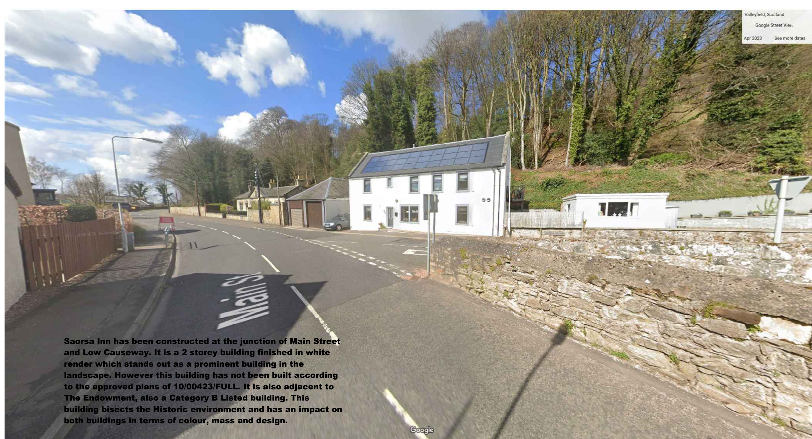
Saorsa Inn has been constructed at the junction of Main Street and Low Causeway. It is a 2 storey building finished in white render which stands out as a prominent building in the landscape. However this building has not been built according to the approved plans of 10/00423/FULL. It is also adjacent to The Endowment, also a Category B Listed building. This building bisects the Historic environment and has an impact on both buildings in terms of colour, mass and design.