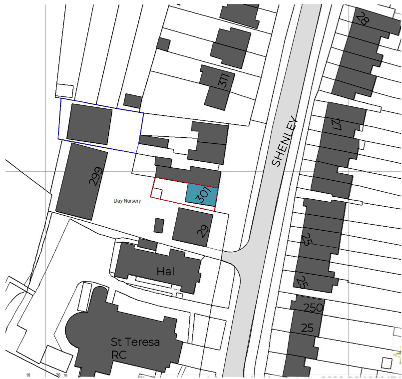
Location Plan 1: 1250