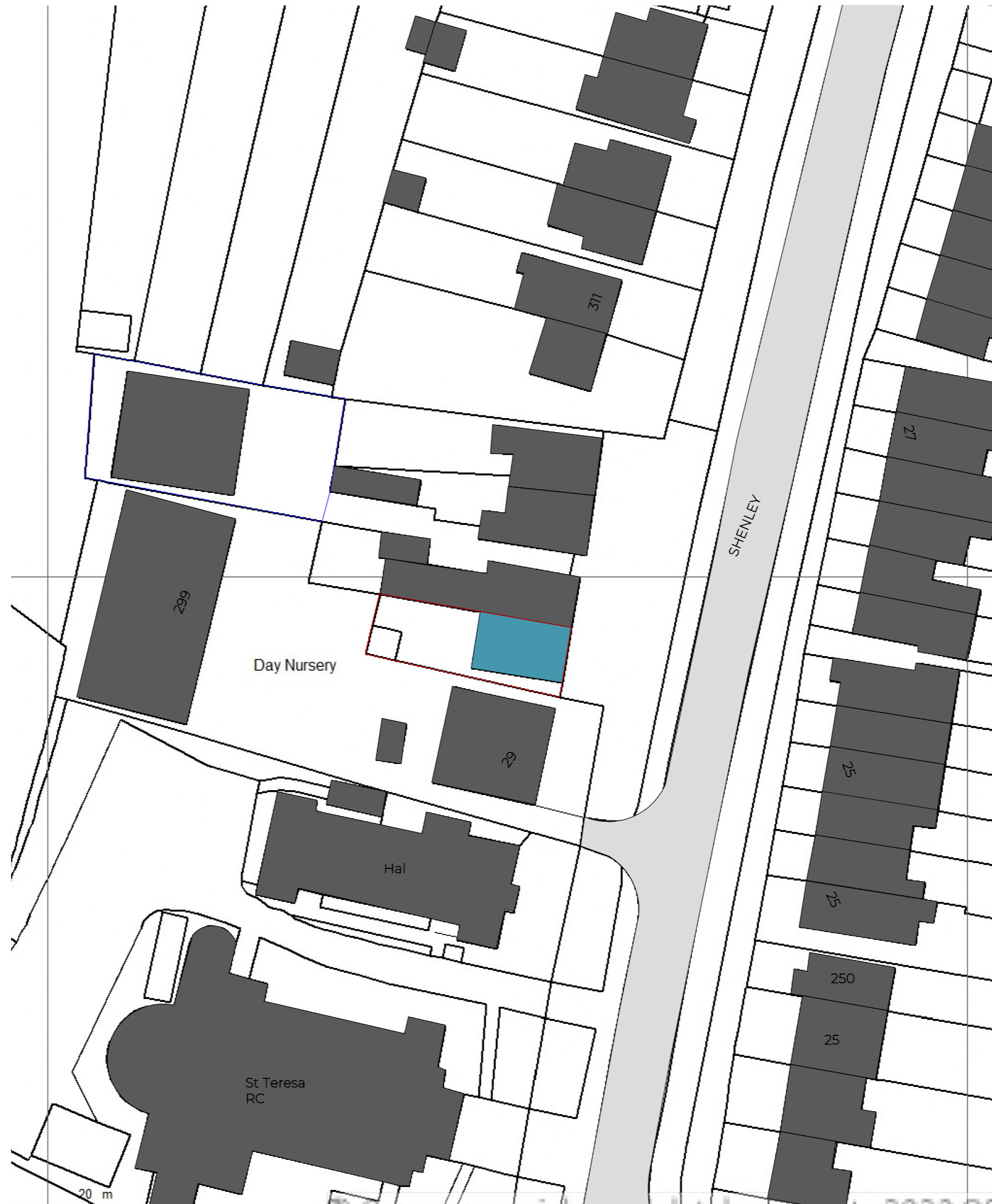
Proposed site plan 1: 500