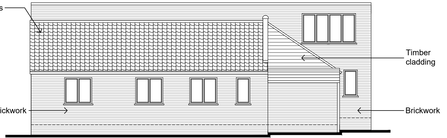
Existing East Elevation (1:100 scale)