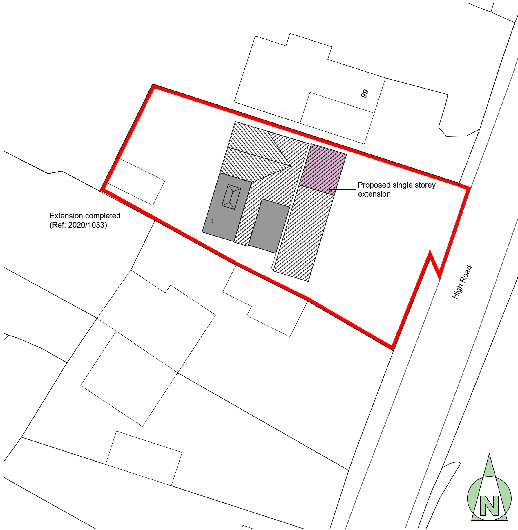
Proposed Site Plan (1:250 scale)