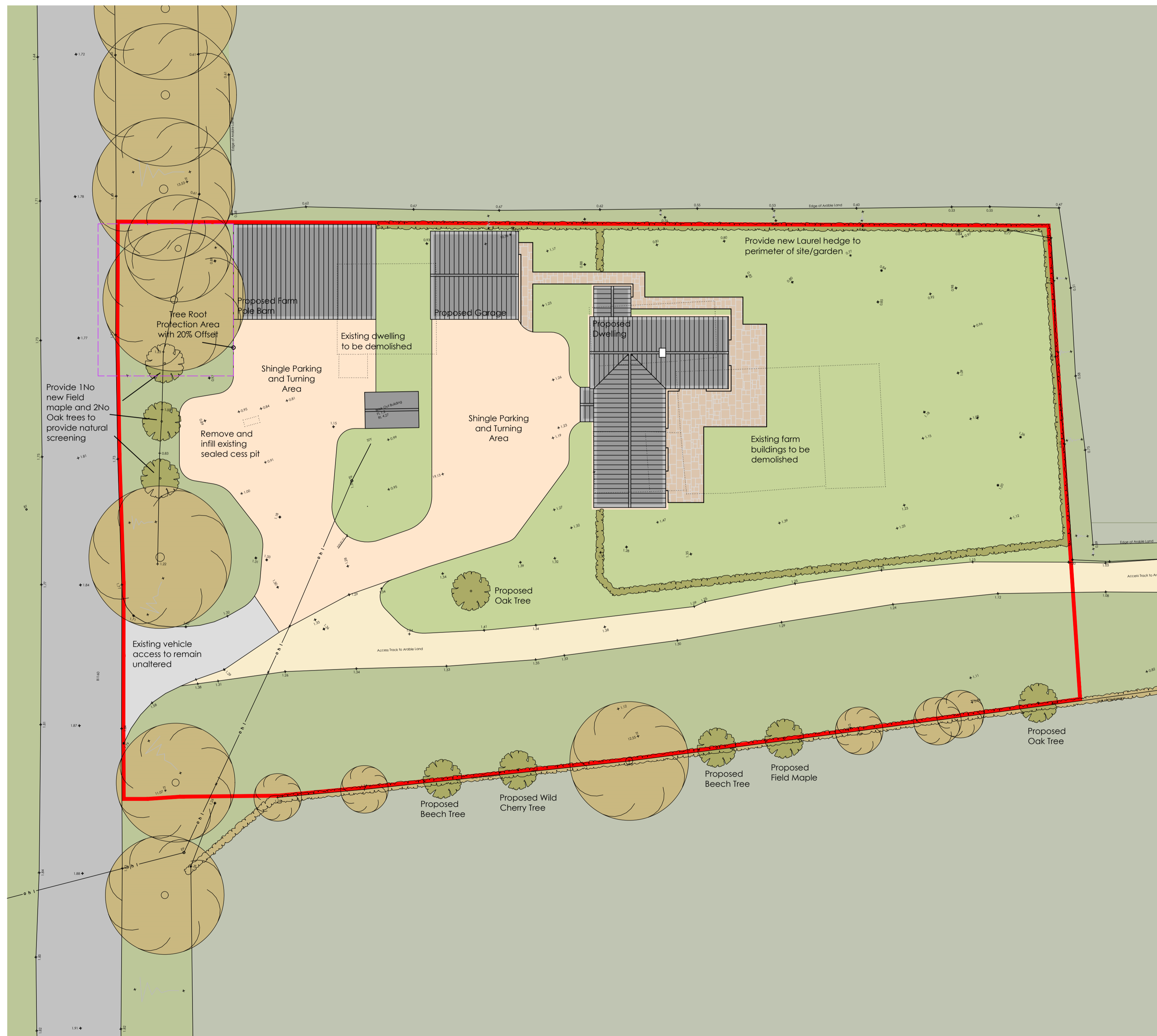
Proposed Site Plan 1:200