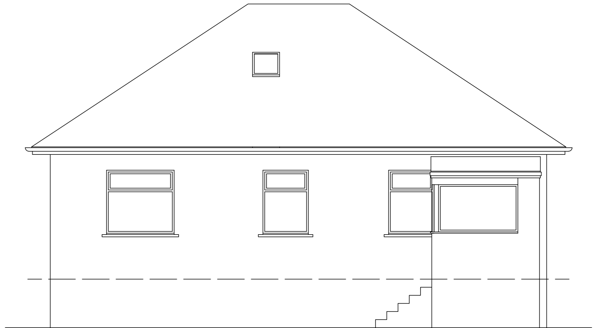
rear elevation as existing