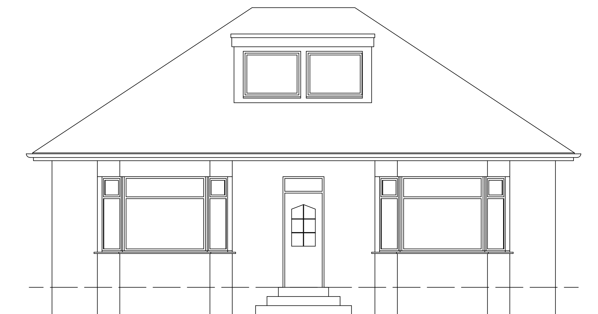
front elevation as existing (no change)