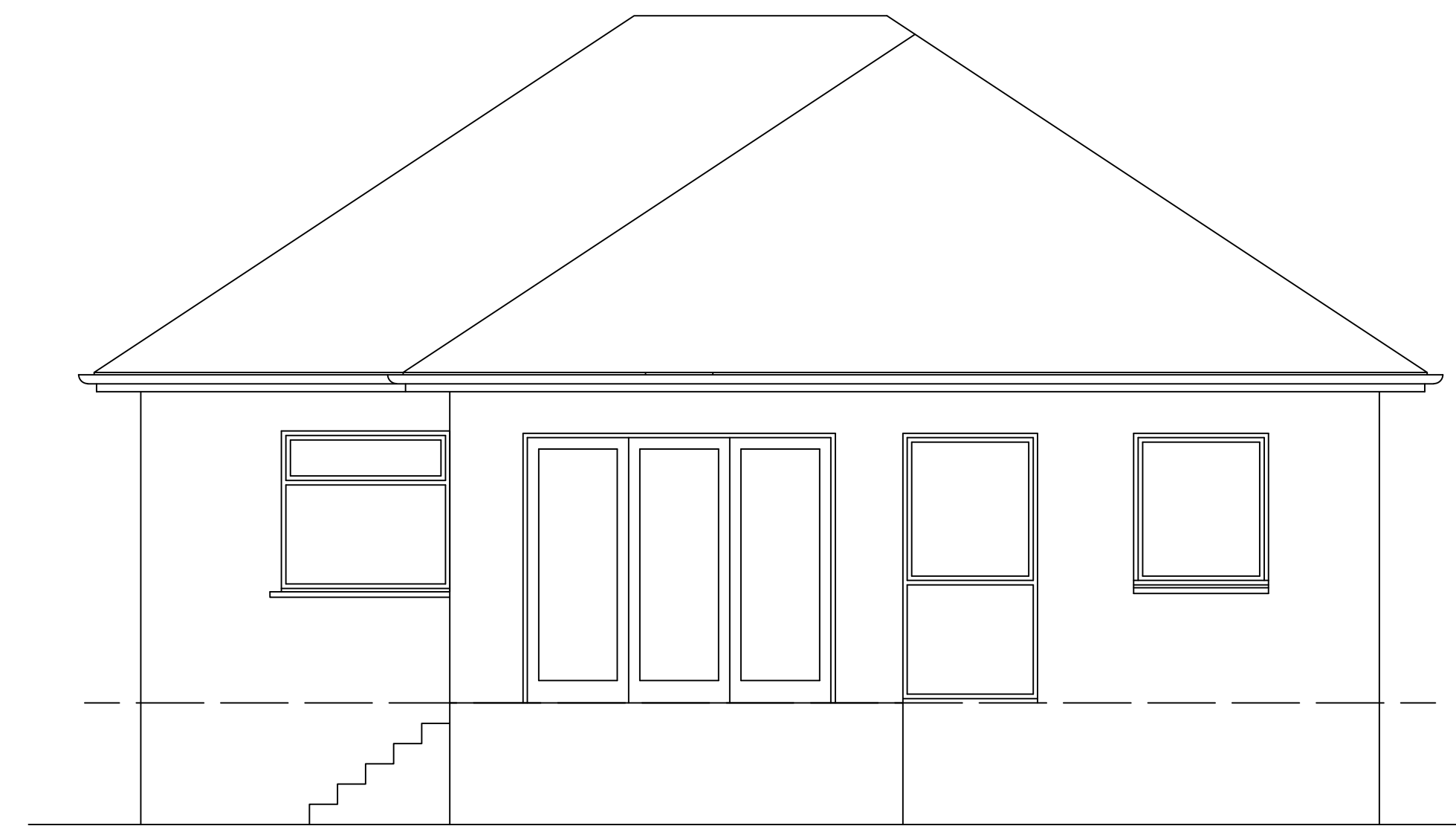
rear elevation as proposed