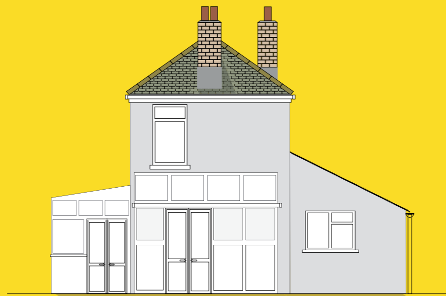
EXISTING LEFT ELEVATION (West facing)