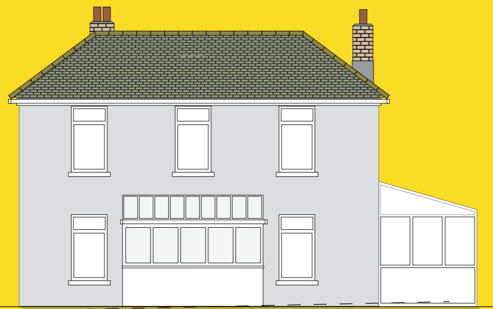
EXISTING REAR ELEVATION (South facing)