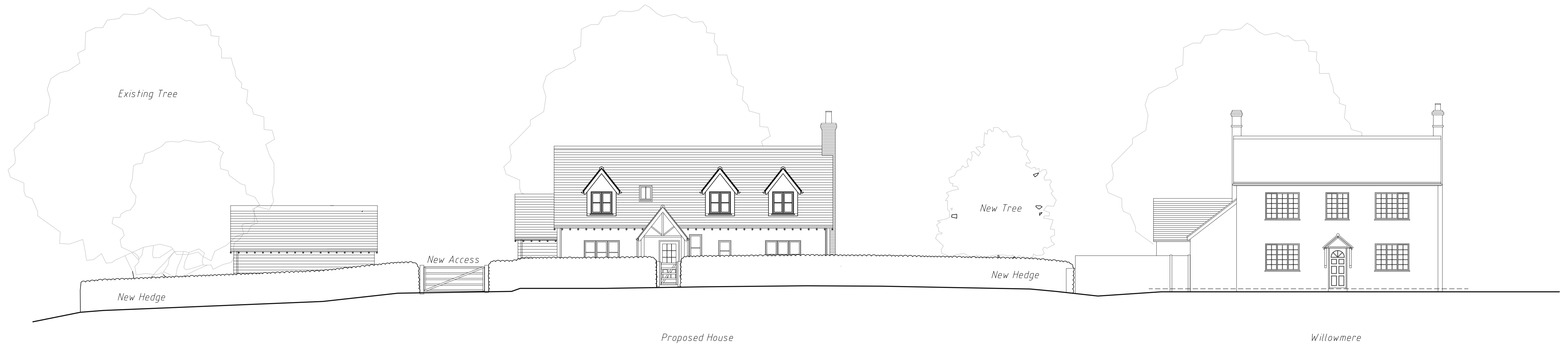
69.000 East Facing Front Elevation