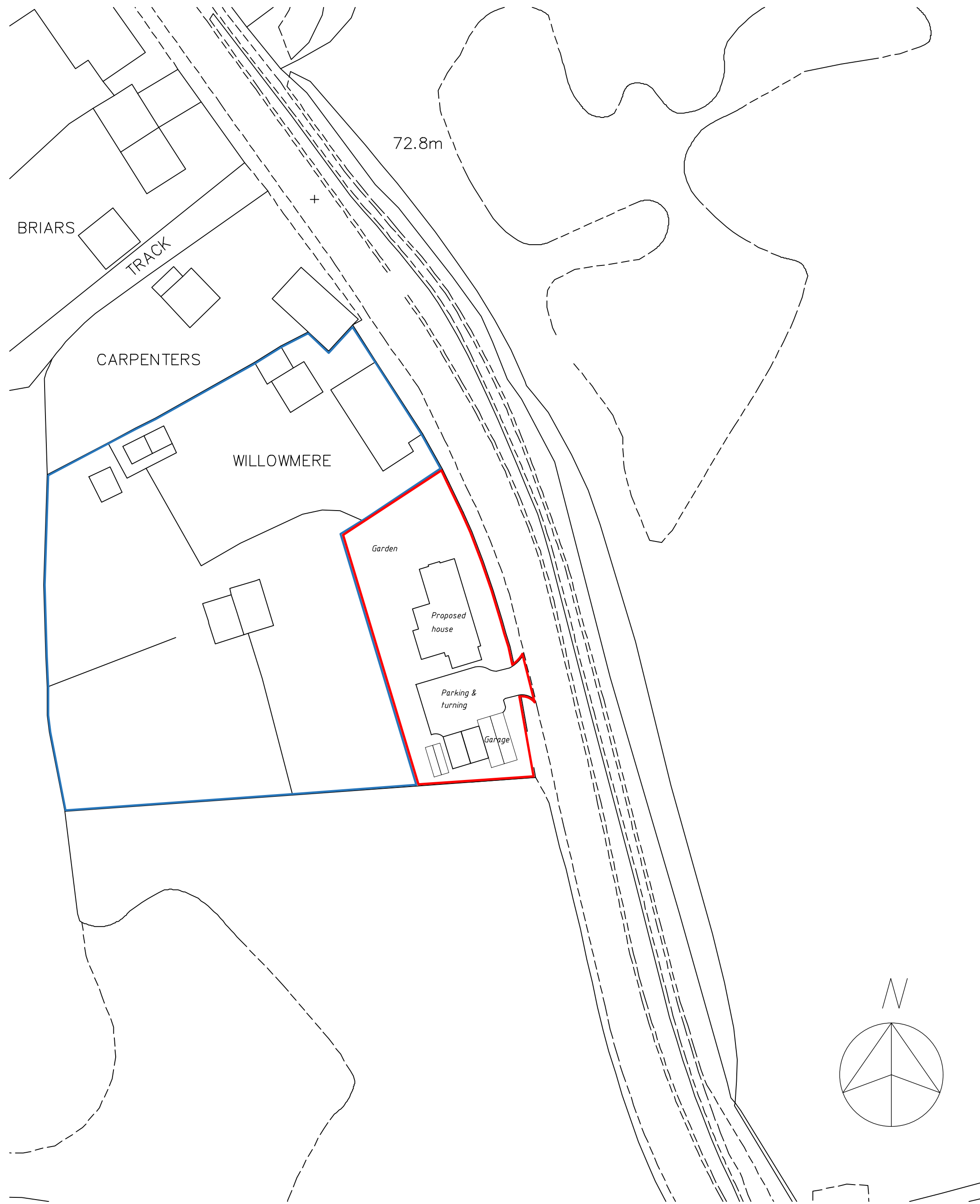
PROPOSED BLOCK PLAN 1:500