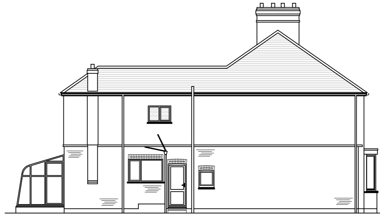
Existing Side Elevation (Garage not shown for clarity)