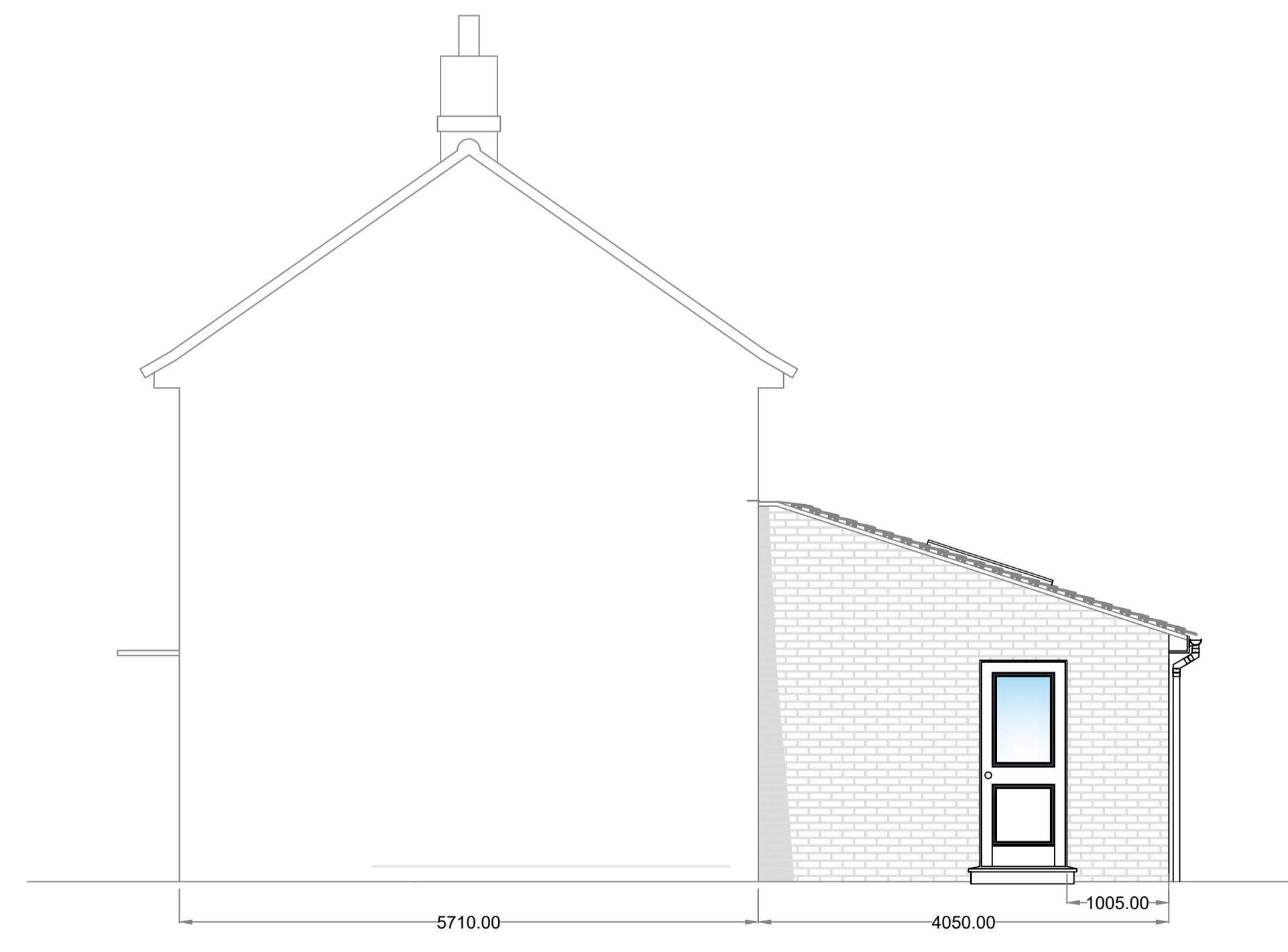
PROPOSED SIDE 2

THIS DRAWING SHOULD BE READ IN CONJUNCTION WITH CONSTRUCTION NOTATION DOCUMENT PTS 142