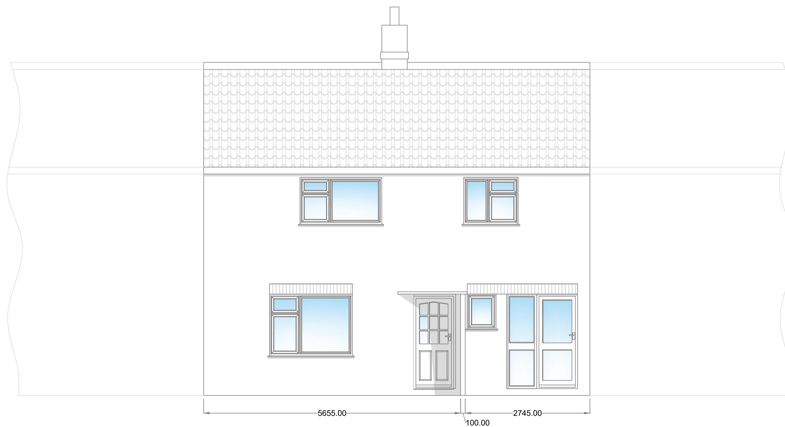
PROPOSED FRONT (NO CHANGE)