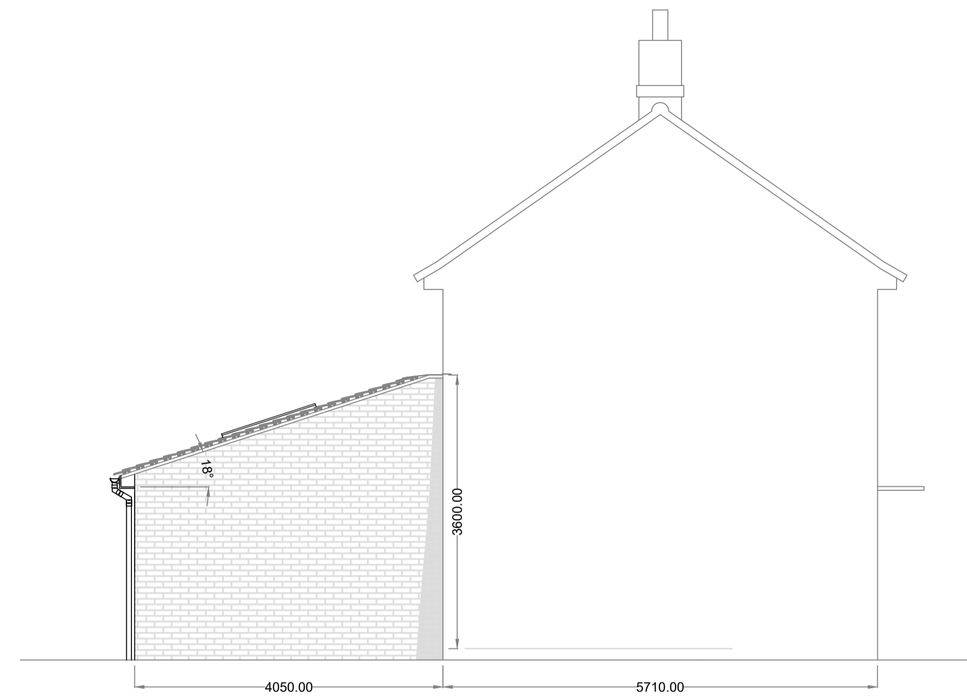
PROPOSED SIDE 1