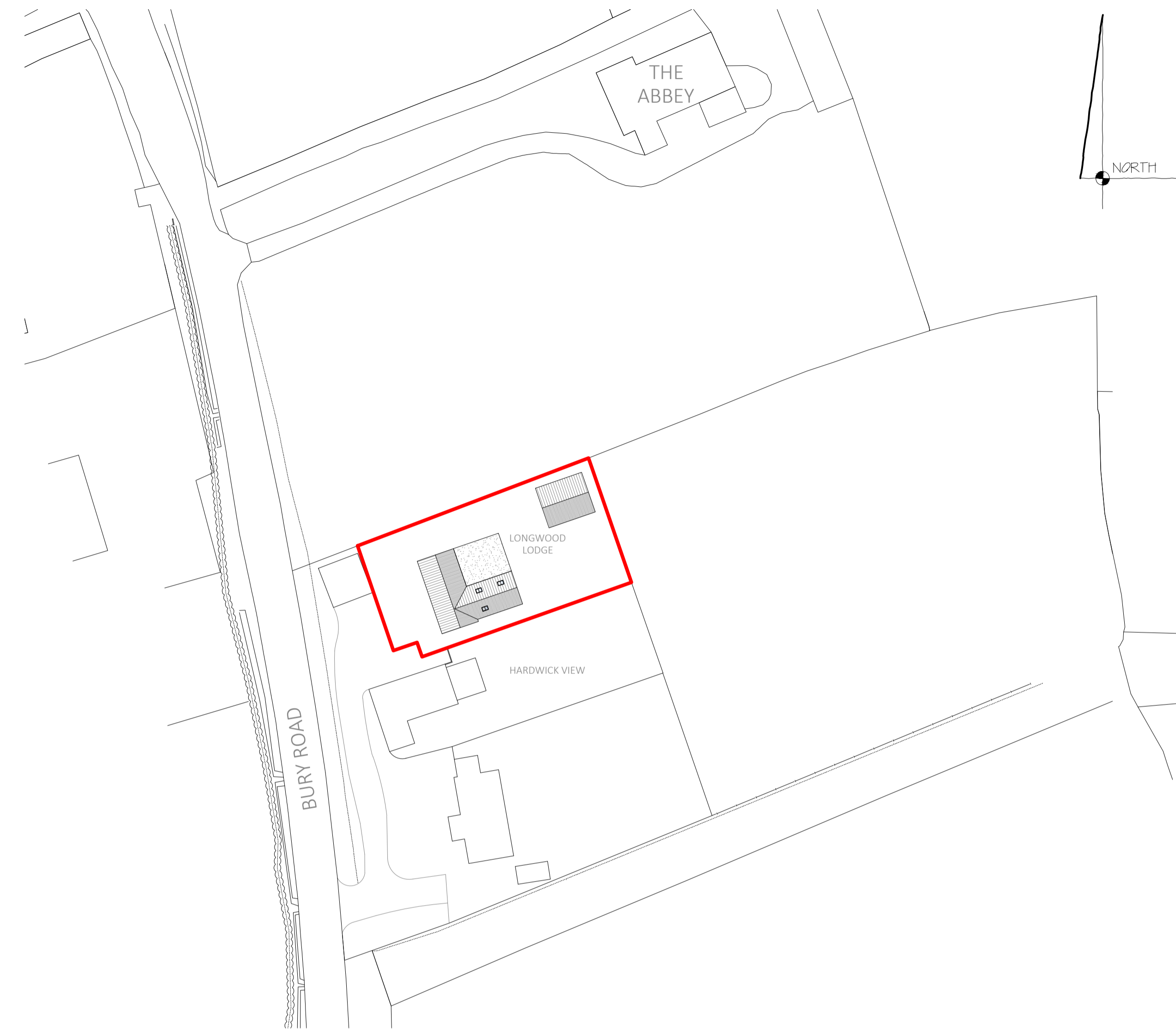
Proposed Block Plan 1:500 @ A1 Downloaded from Ordnance Survey Data Note - positioning of adjacent properties indicative only