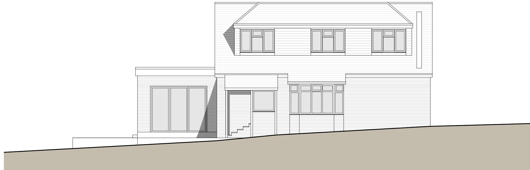
Side Elevation (south)