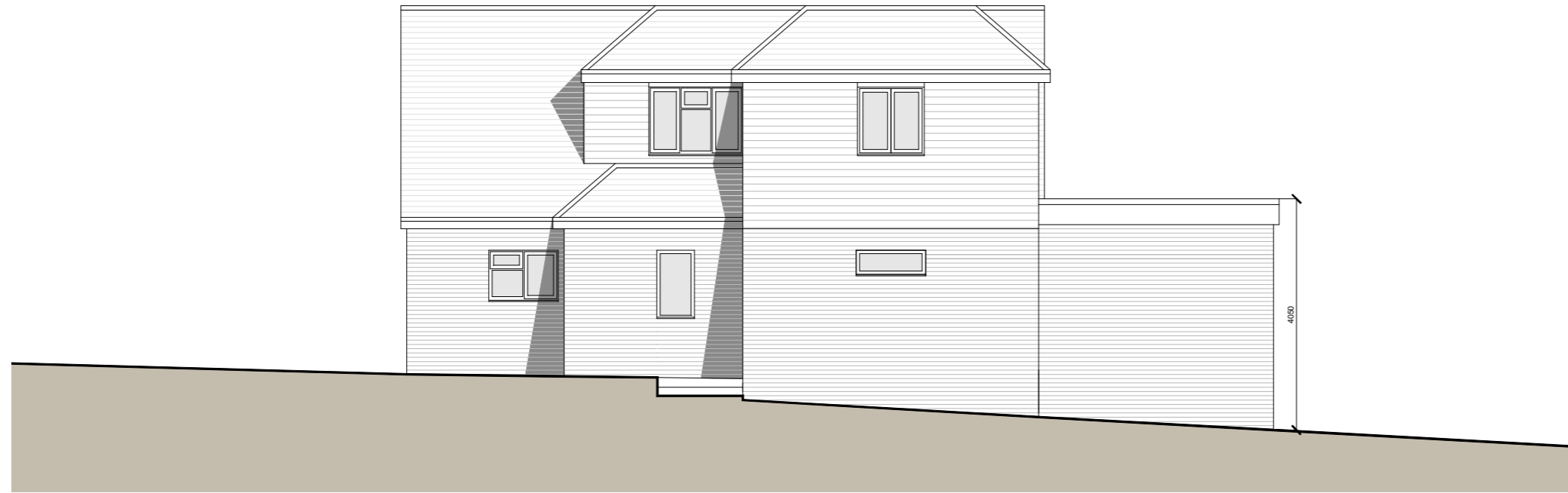
Side Elevation (north)